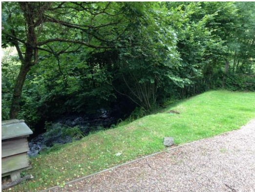
View of the river