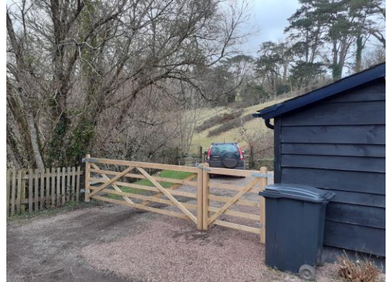
Car park area