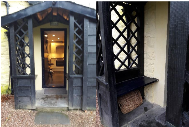
Entrance and wooden seating in porch