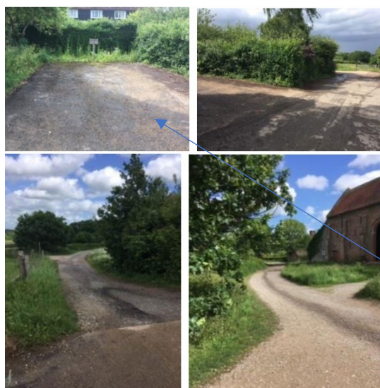
Designated parking spaces.

There are 2 designated carpark spaces behind the restaurant. The area is tarmac however uneven with potholes. As you make your way down the hill past the restaurant and barn, the gravel track is very uneven and can be muddy in wet conditions as you come past the shop and towards the garage where the gate for the holiday cottage is located.