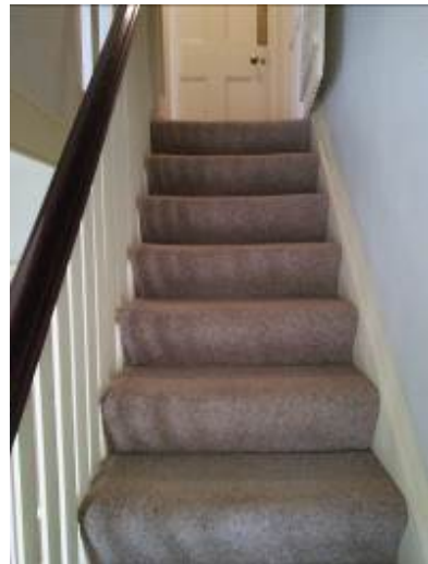
Looking up stairs