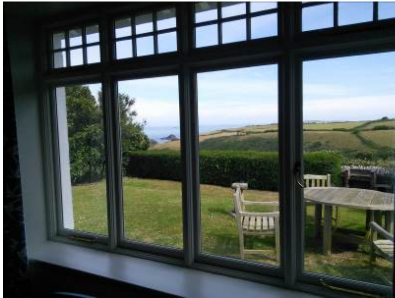
View from sitting/dining room