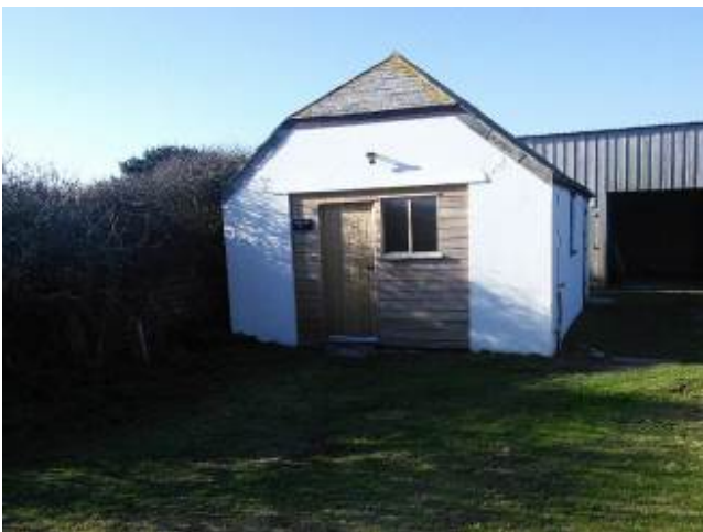
Laundry room near the parking area