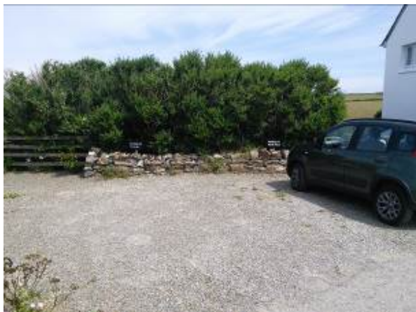
Parking area for Porth Mear and Trescore