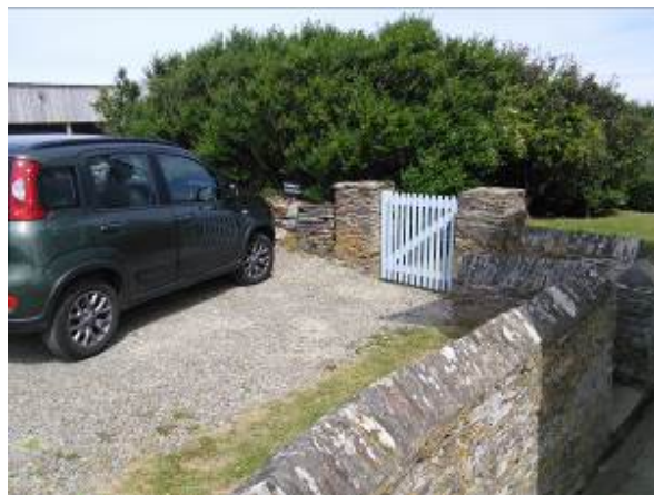
The one designated for Porth Mear is nearest to the gate