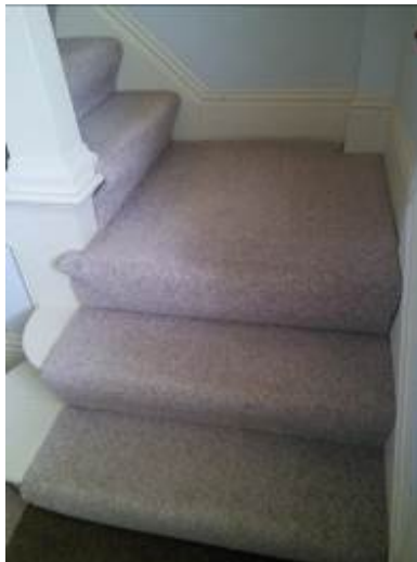
Bottom of stairs