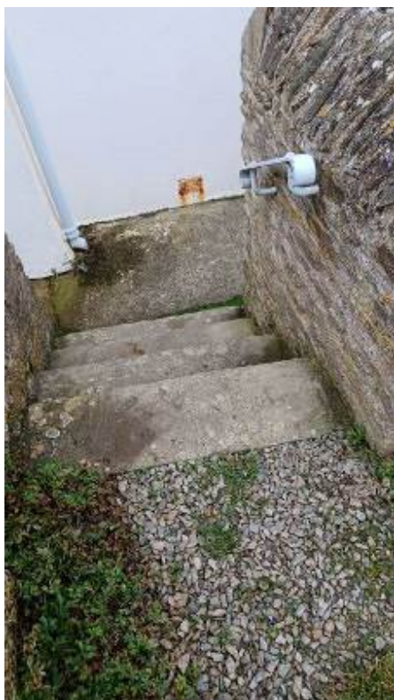
Steps down from car parking area