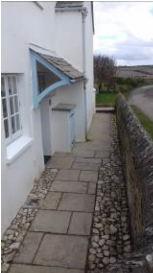
Path to front door