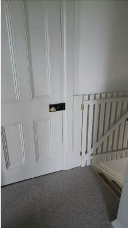
Landing showing stairgate