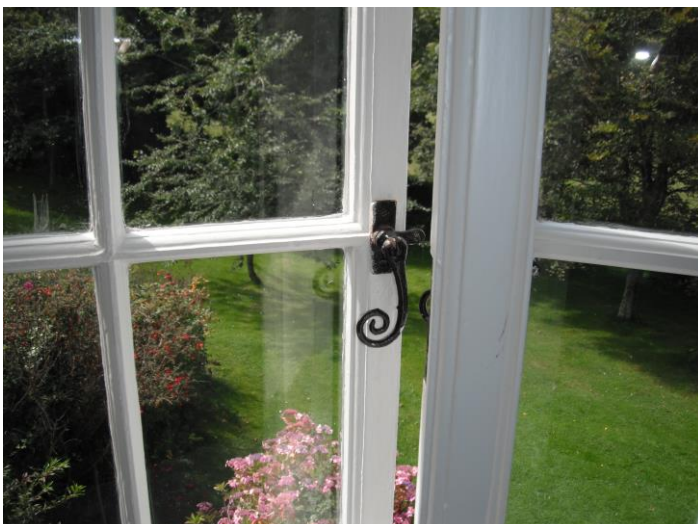
View from Bedroom