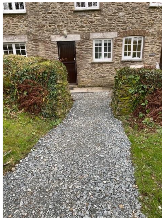
Path to Main Entrance from unloading bay.