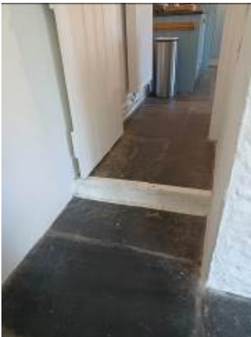
Step from sitting room to kitchen.