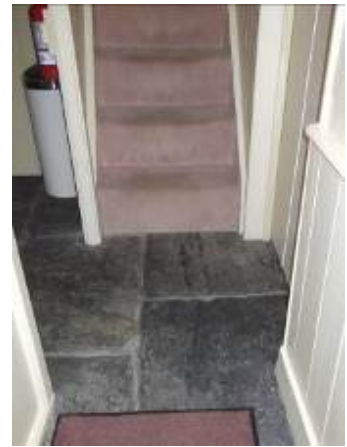
Bottom of stairs