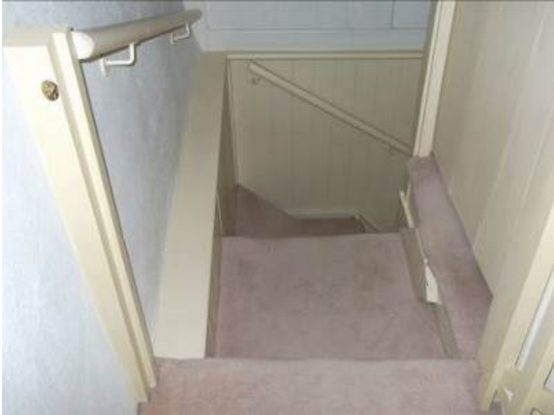
Stairs looking down from the landing area.