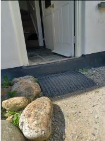
Step up to front door