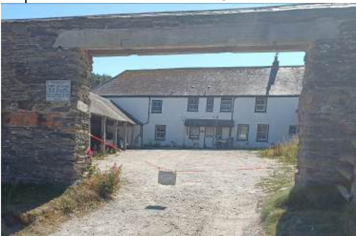
The second car space is just to the left after the chain