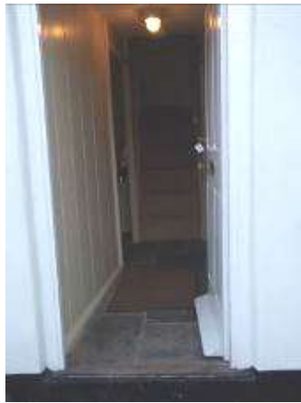
View from front door to stairs