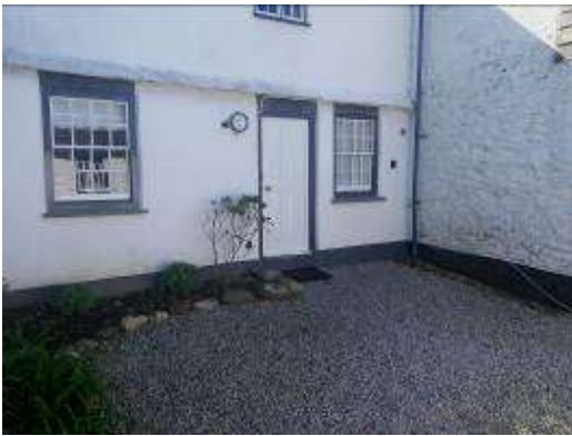
Car parking area for one vehicle