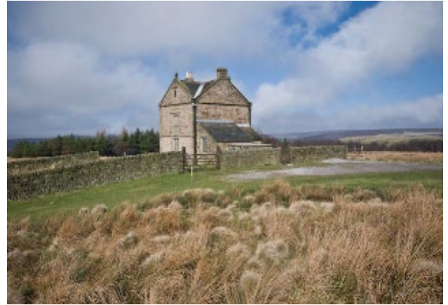
View towards Lodge showing parking area