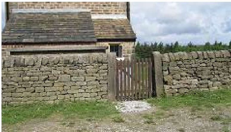
Car parking area and entrance gate