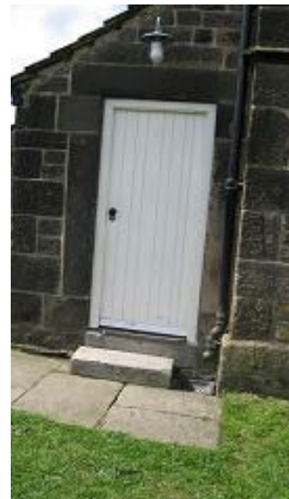
Entry door into cottage