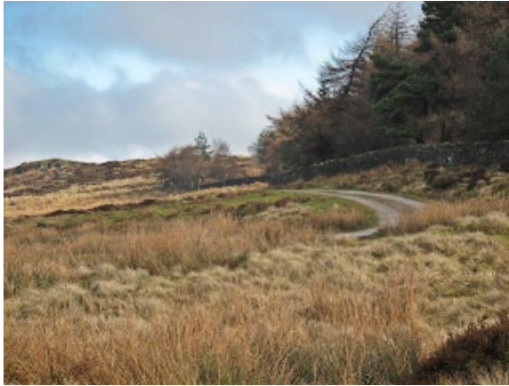
View of part of access track to Lodge