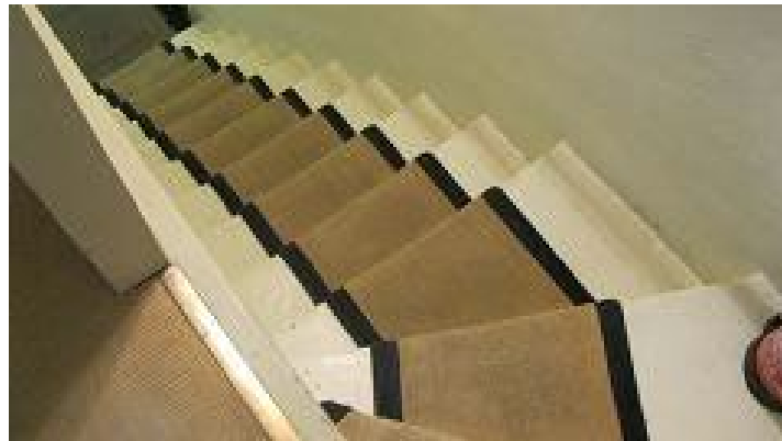
View of Staircase to first floor from top and bottom