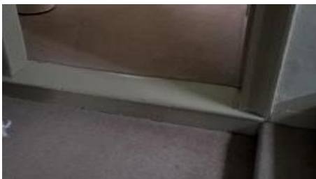
Threshold from hall to Sitting room