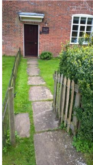
Path to front door