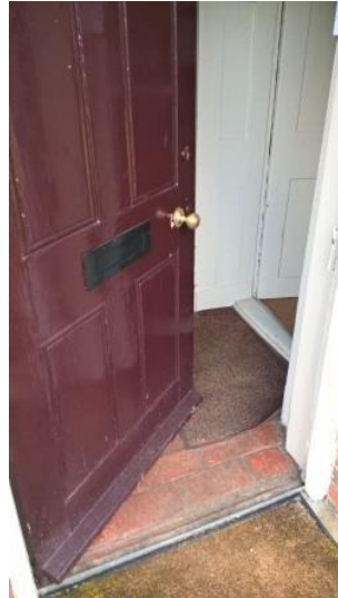
Front door to lobby