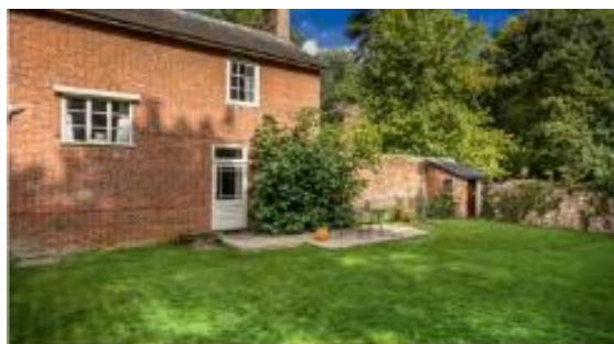
Patio/seating area in main/rear garden