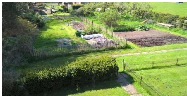
Front garden path leading to allotment /woodland