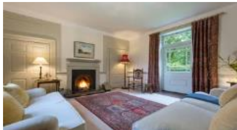
Sitting room with door to garden