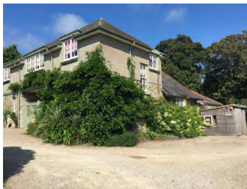
Stable flat with keysafe on logstore shown