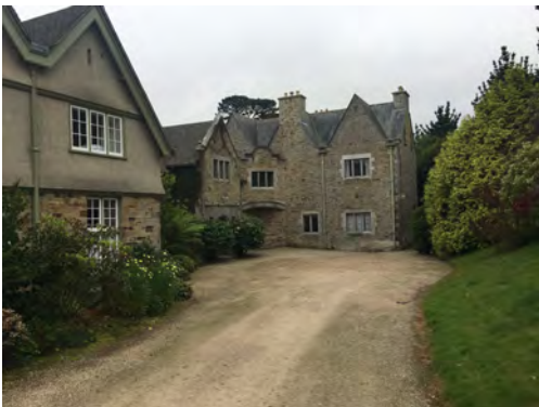
Shared parking area for Chatham and Bosveal