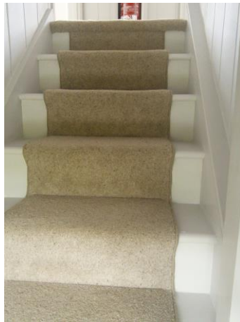
Second tier of stairs