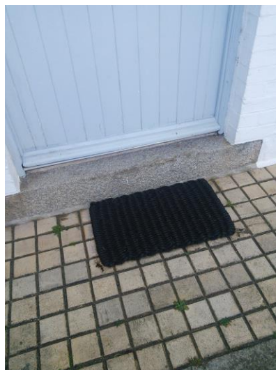
Step up into Stable Cottage