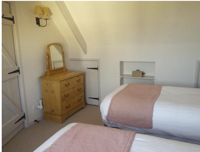
Bedroom as a twin