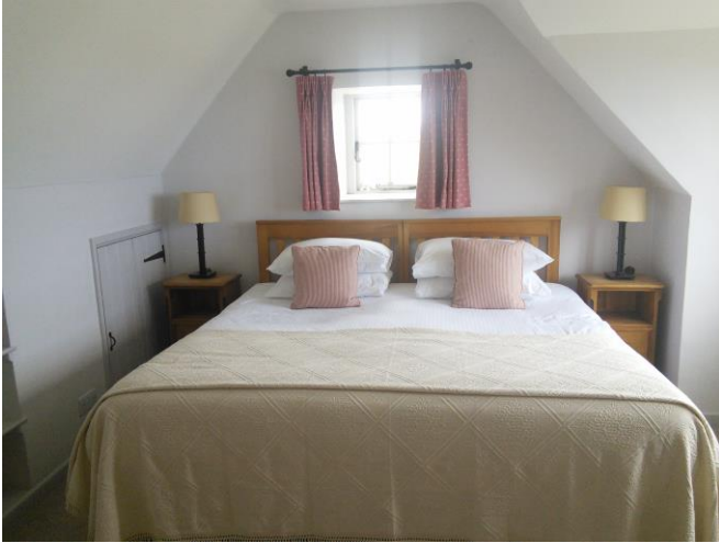
Bedroom as a double