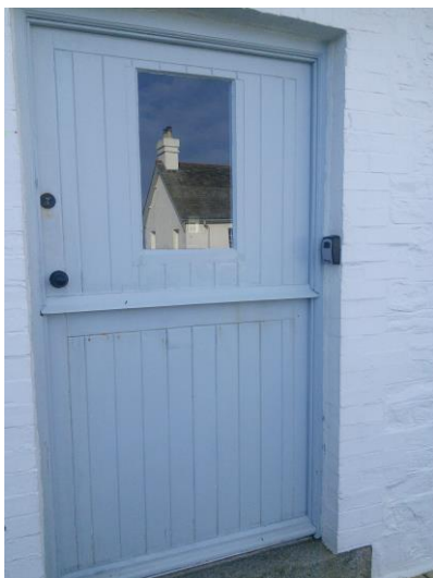
Front door with key safe on the right