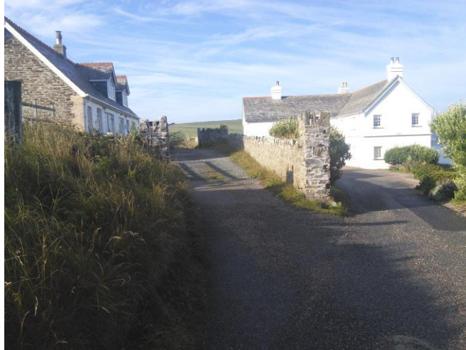
Stable Cottage is on the left. Doyden House is on the right.