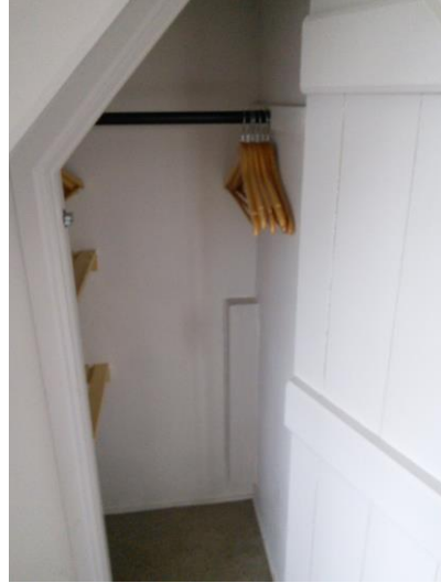
Built in wardrobe