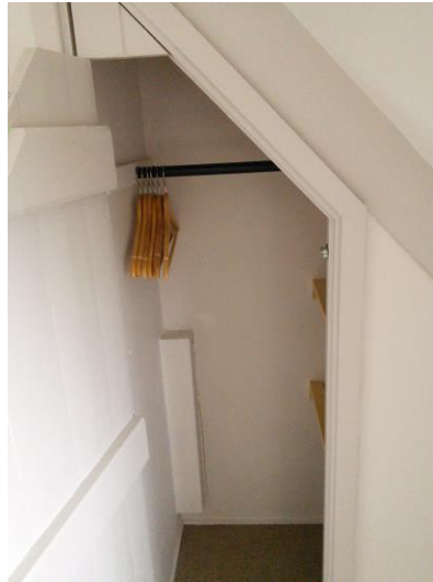
Built in wardrobe