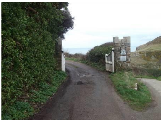
The entrance gates to Doyden House