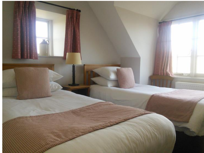
Bedroom as a twin