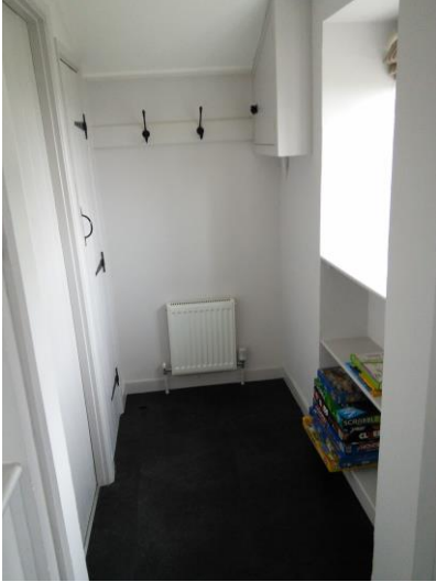
Boot room leading to shower room/wet room