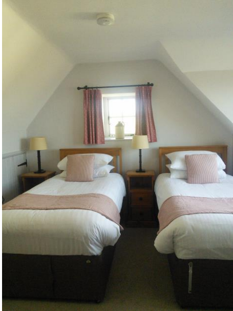
Bedroom as a twin