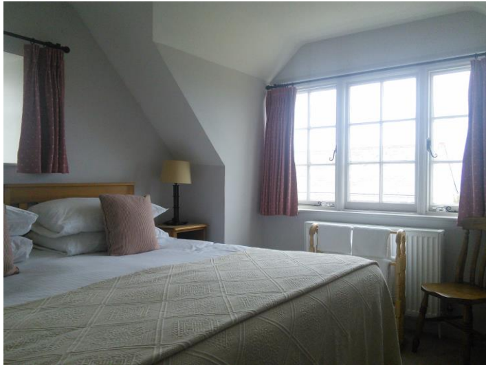
Bedroom as a double