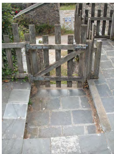
Top of steps