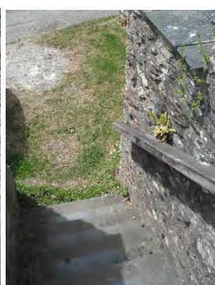
Steps from lane into garden