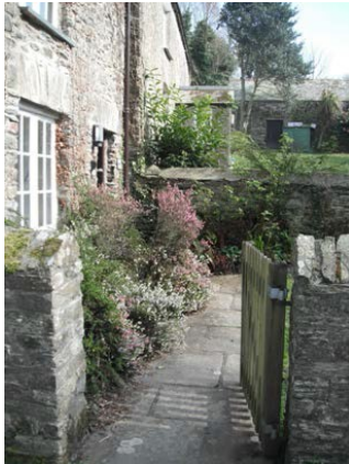
Path to main entrance