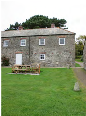
Patio on shared front lawn