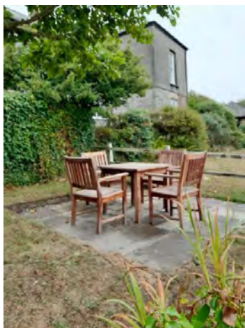
Patio area opposite the door