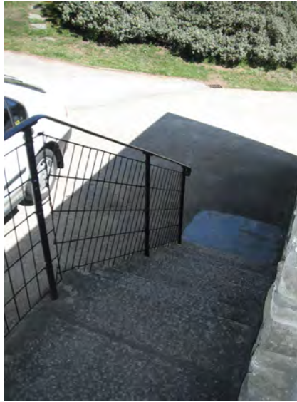
Steps and parking area