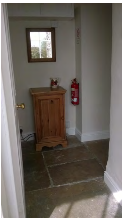
Hall with wi-fi cabinet