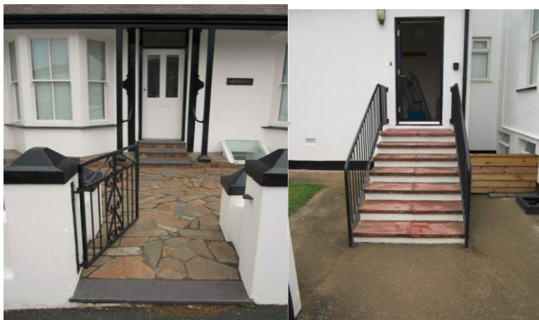
Front door and rear main access