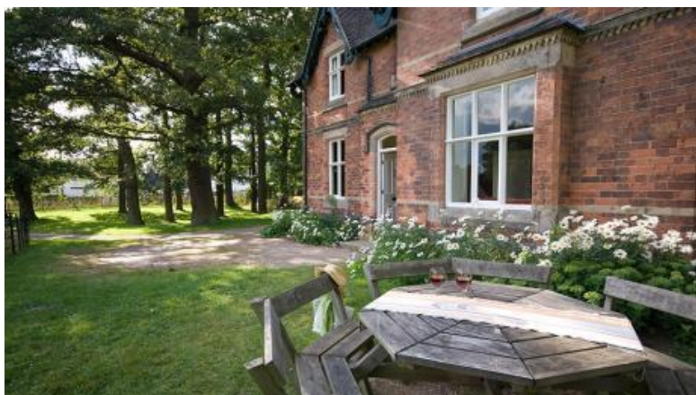
View of Park House showing parking area outside the front door.