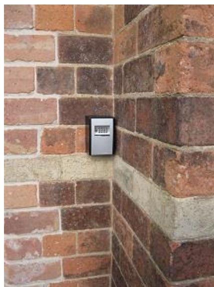
Main Entrance Door & Key Safe