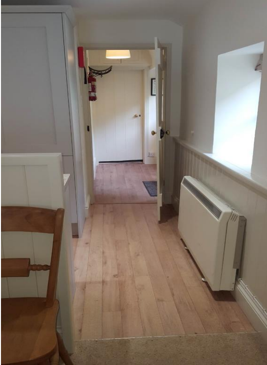
Looking from sitting room past kitchen into entrance hall