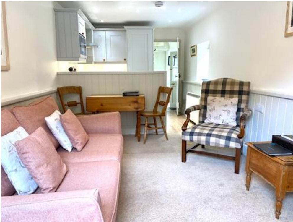
Looking from sitting room to dining table and kitchen