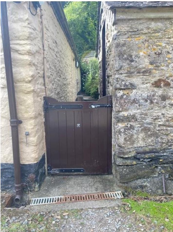
Flood defence gate