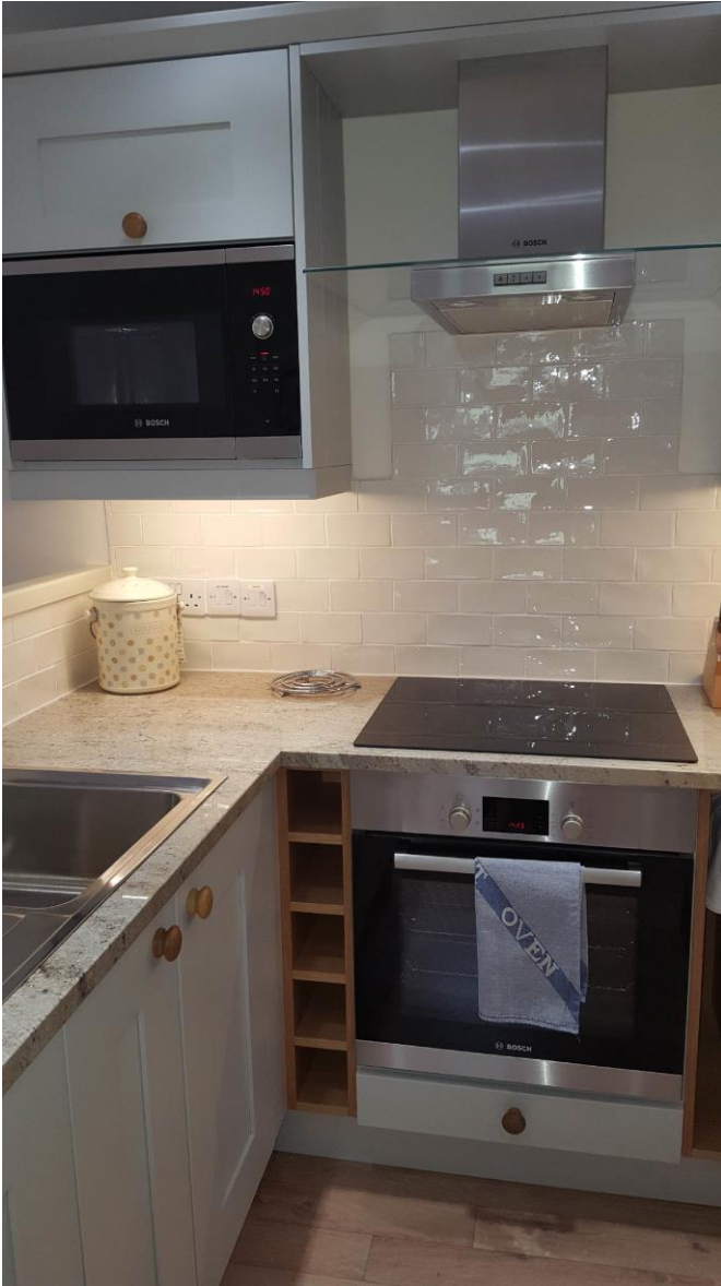
Kitchen with microwave in wall unit