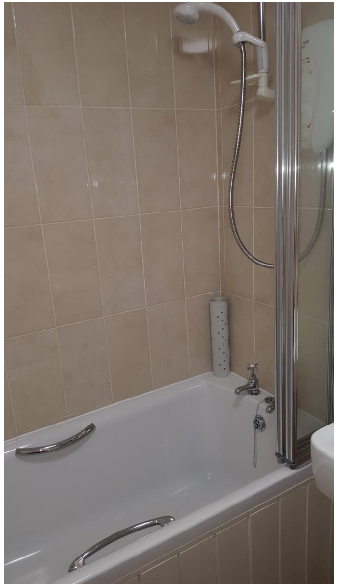
Bath with electric shower over