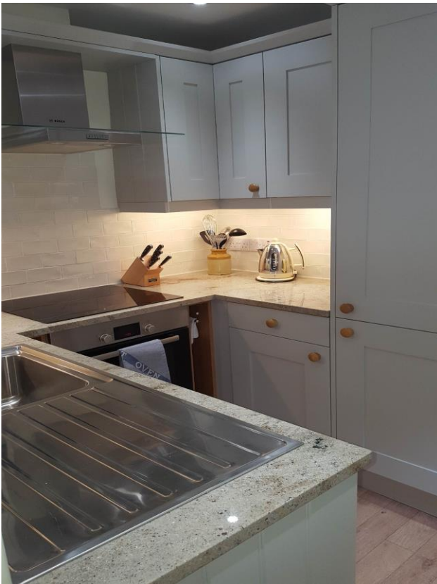
Kitchen with built in fridge/freezer