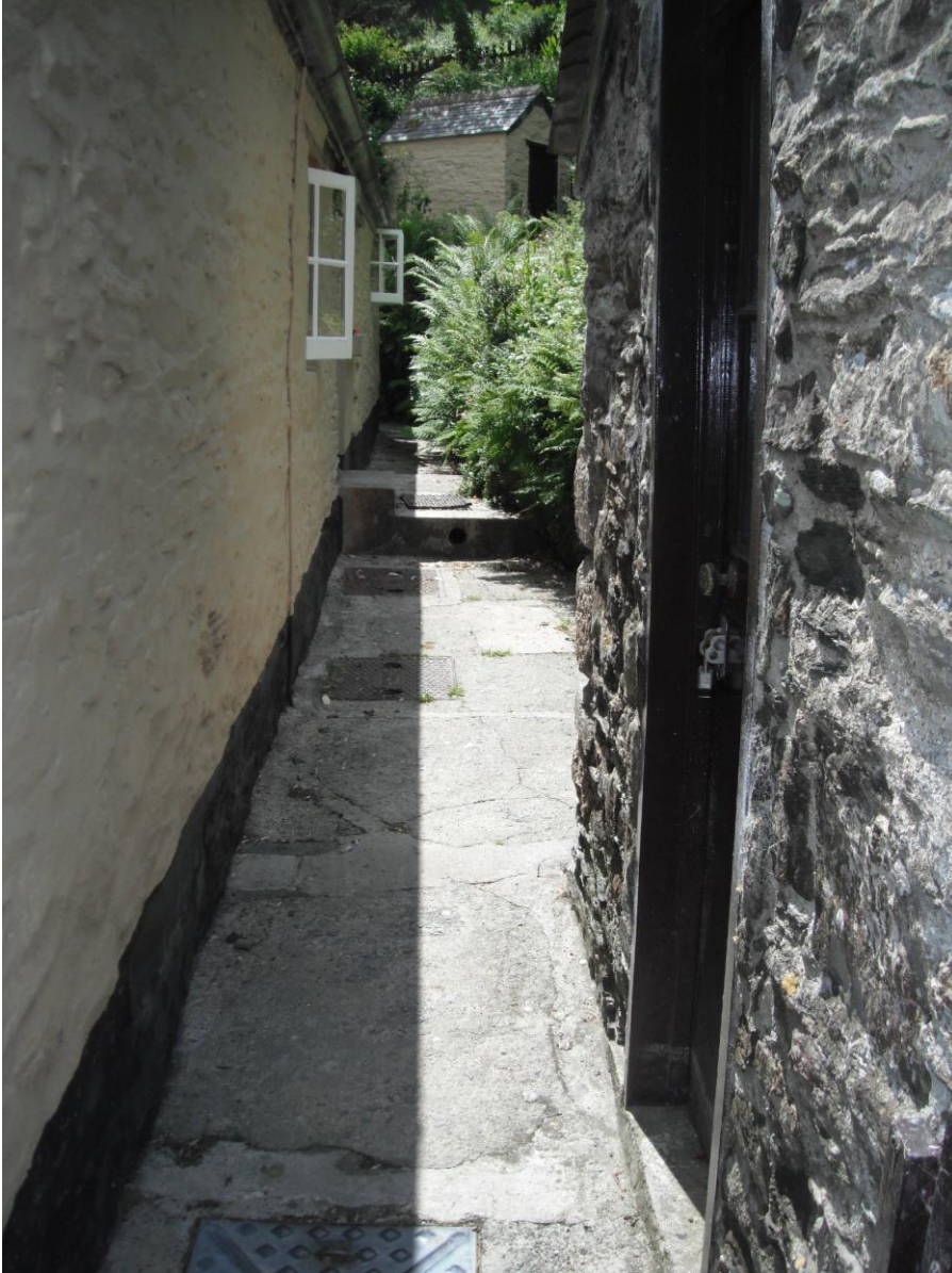
Path to entrance door