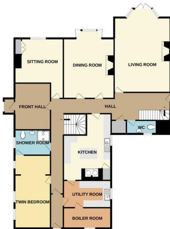
GROUND FLOOR 2288 sq.ft. (212.6 sq.m.) approx.