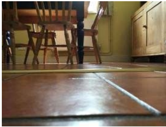
Gold coloured threshold divider between kitchen & diner 20mm high