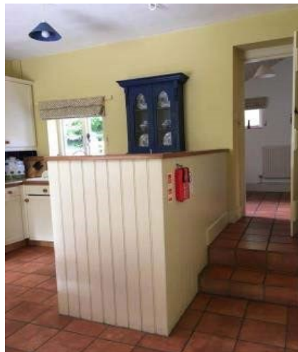
Steps down from entrance lobby to kitchen