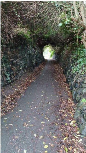
Margaret's lane tree tunnel