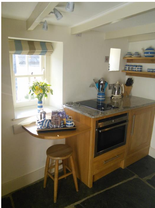
The picture shows one of the stools