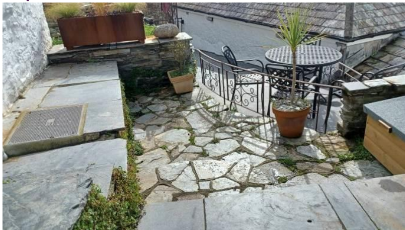
Looking down from the seating area