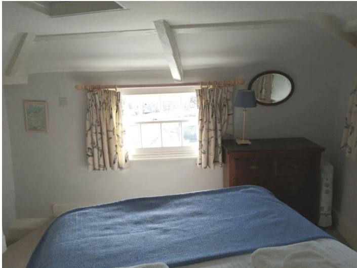
Bed faces the small window overlooking roof tops