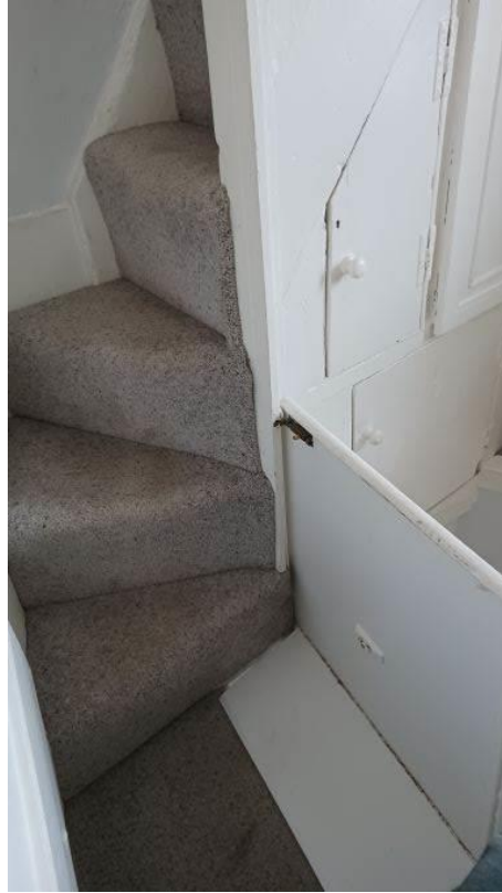
Stairgate in place