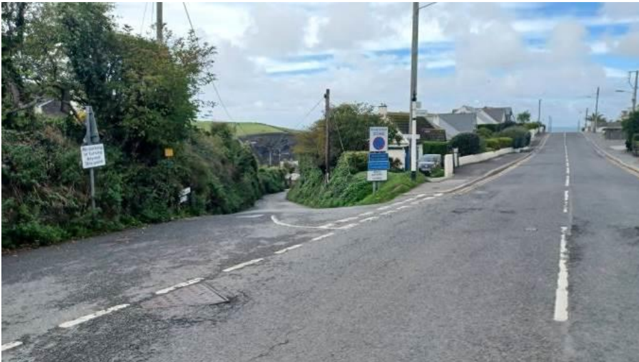
Lane on the left is Trewetha lane, leading towards Rose Hill