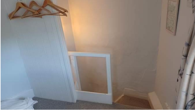
View from bedroom towards the stairs