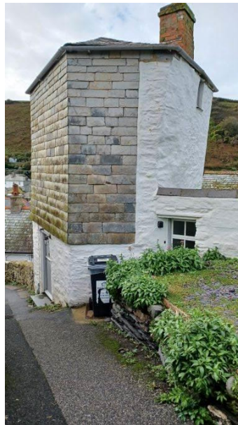
Approach to The Birdcage