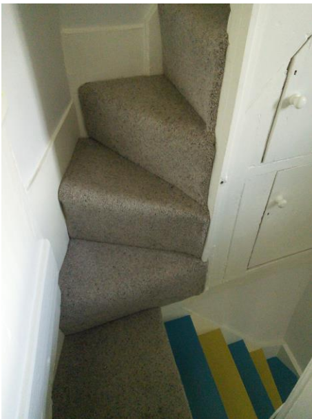
View from sitting room without stairgate in place