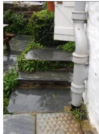
Steps from bathroom door