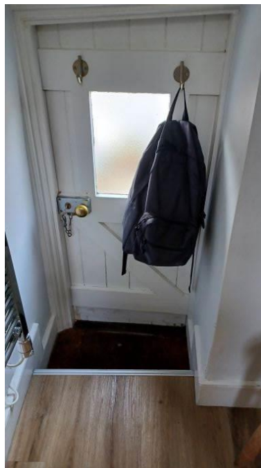
Door to terrace from the bathroom