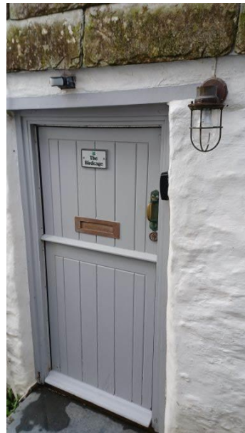
The Birdcage front door