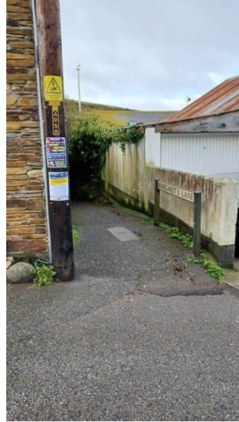
Entrance to Margaret's Lane