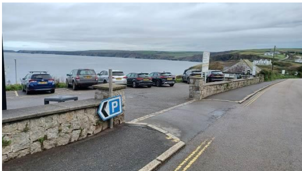
Nearest car park