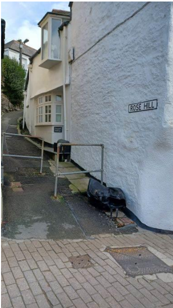
Rose hill from The Harbour