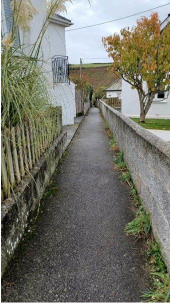
Path between houses