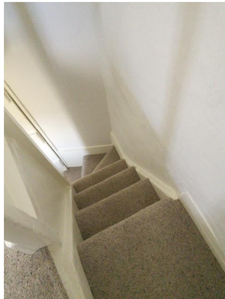
Stairs from bedroom to sitting room