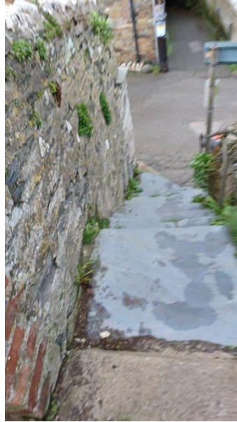
Steps to Trewetha lane