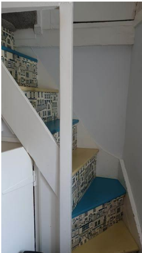
Bottom of stairs from kitchen