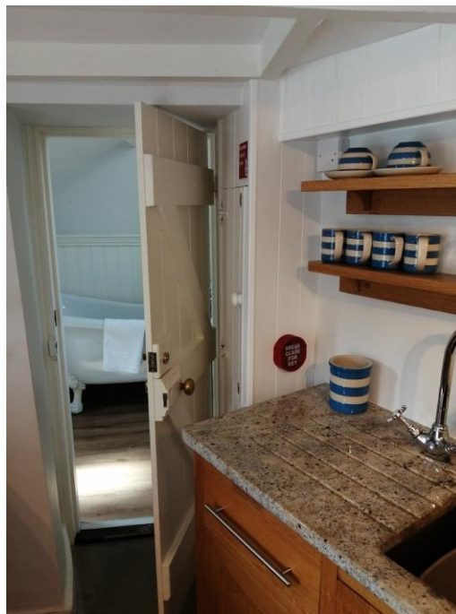
Door to bathroom from the kitchen