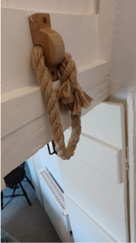
Rope hand hold at bottom of bedroom stairs