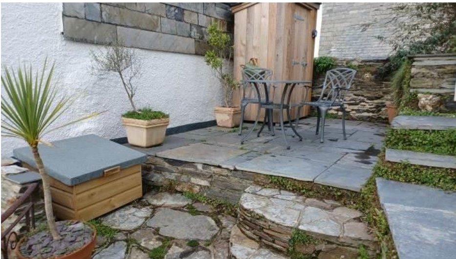
Terrace seating area