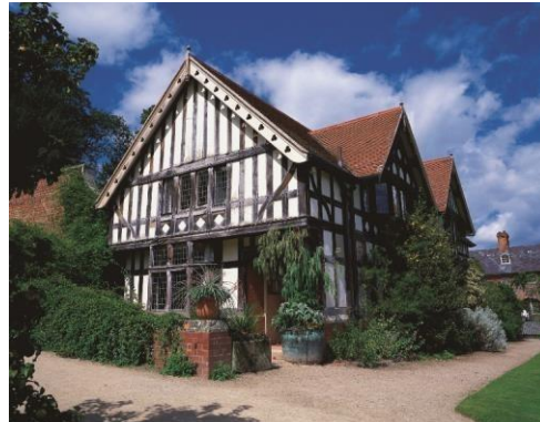
The Bothy Ref No 008014