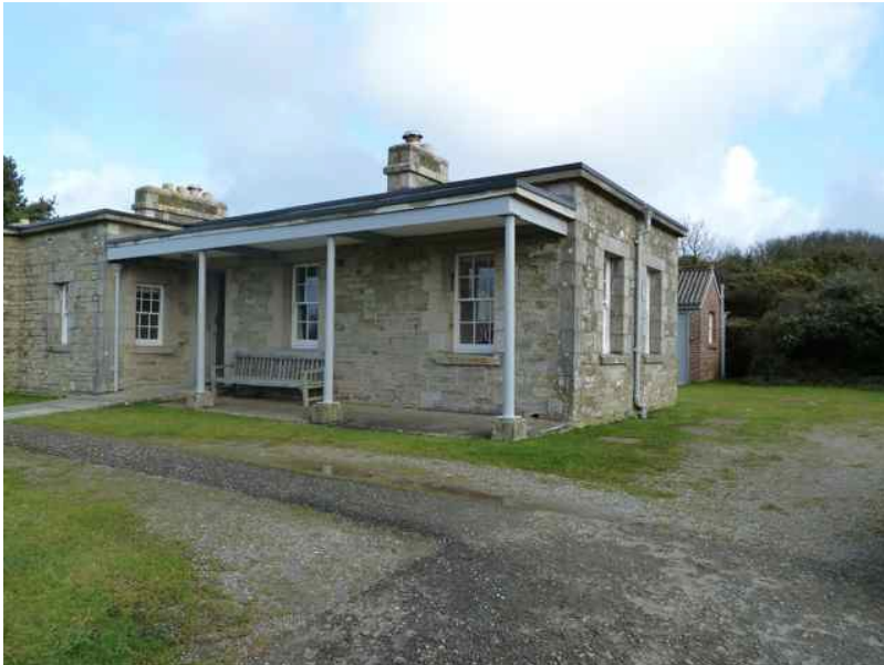
Parking area (to side) and route to front door