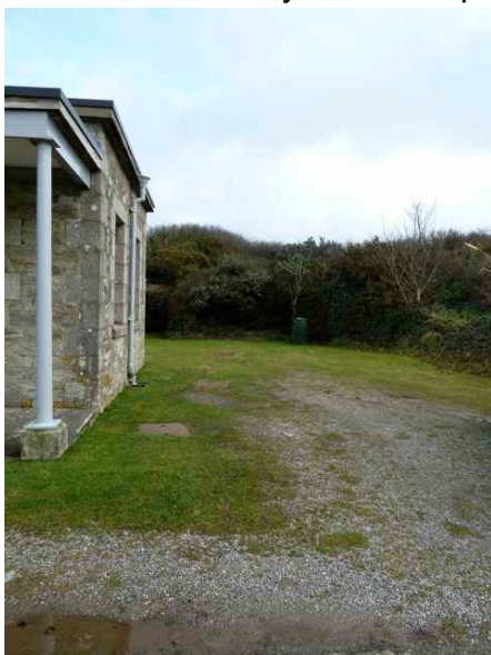
Car parking area