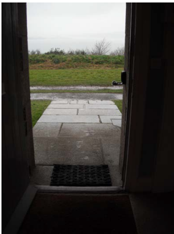
Stone slope to front door