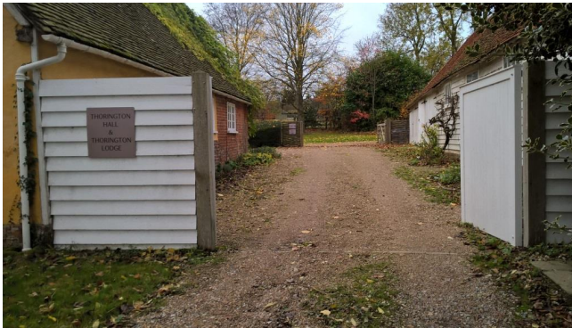
Outer entrance gates to gravel drive