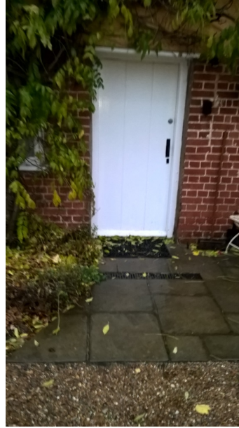
Front door with keysafe to right