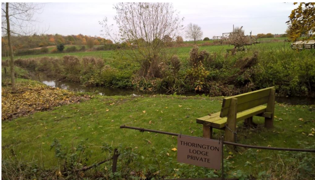
Riverside seating area