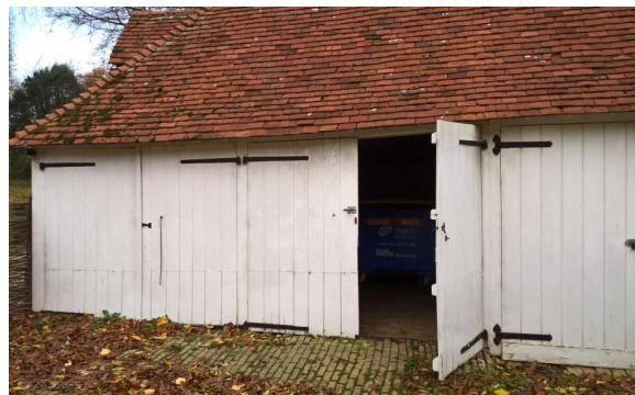
Outbuilding for refuse and wood store