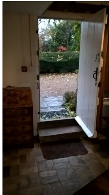
Steps down to living room