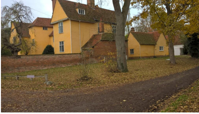
Thorington Hall from the junction of the main road and the side lane