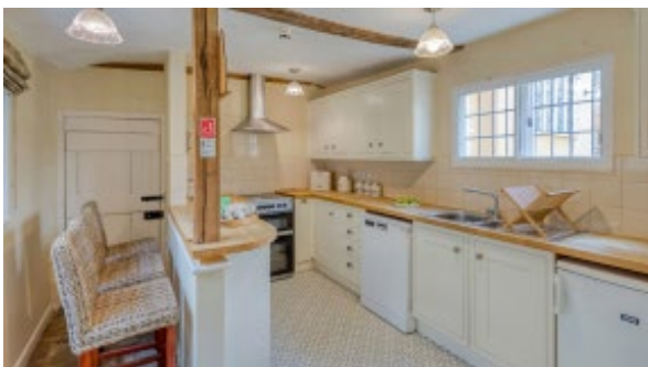
Kitchen with breakfast area to left