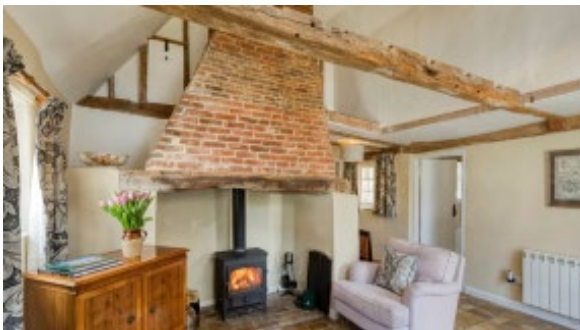
Living area with inner corridor ahead and kitchen door to right