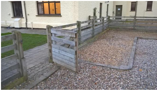
Gate from parking area to path to base of external steps