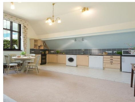
Kitchen showing change in floor covering