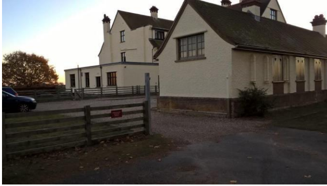
Entrance to gravel parking area by Tranmer House