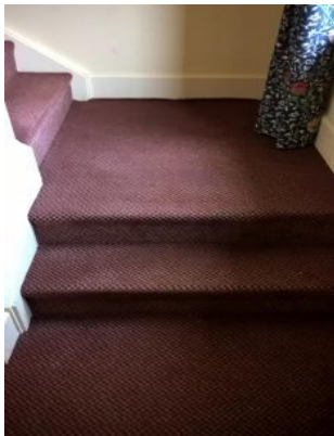
Internal staircase from the first floor to the second floor