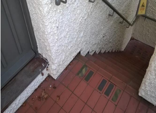
Top of external steps and door to communal lobby