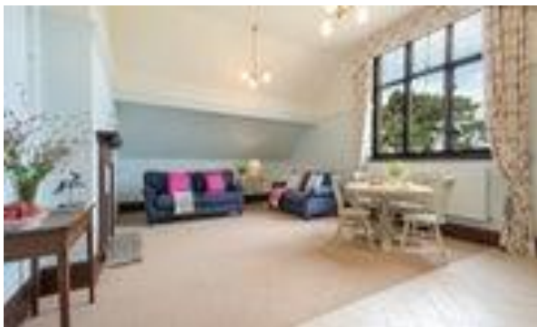
Living room and dining area