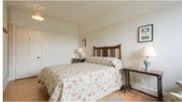
Double bedroom towards door with fireplace on left