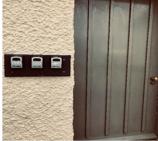
Keysafes on wall outside entrance and at top of step