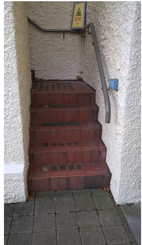
External steps up to the apartment