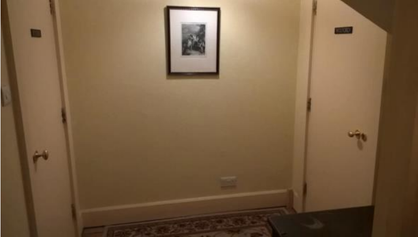
Main entrance to Wilford (on right) from second-floor lobby