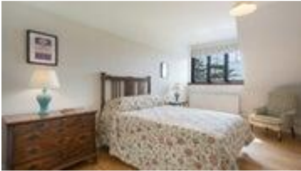
Double bedroom from doorway