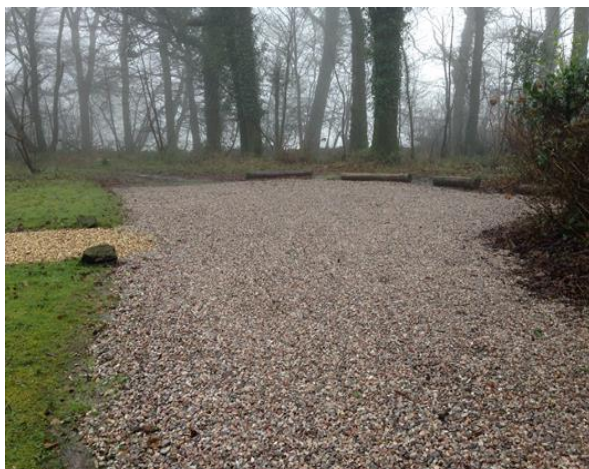
Car park area