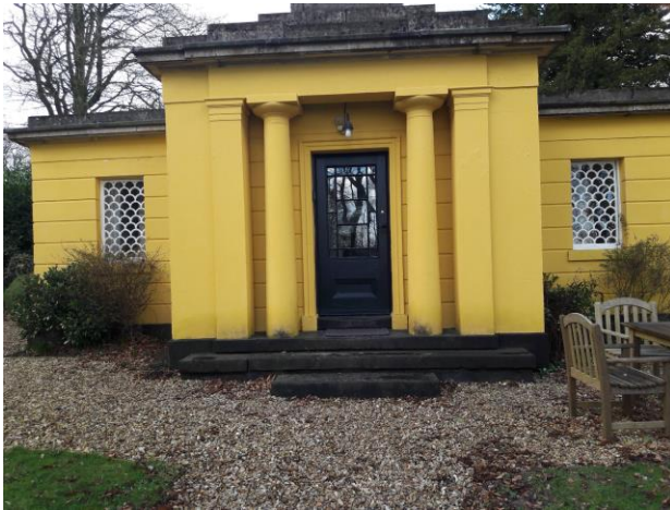
Movement sensor above door