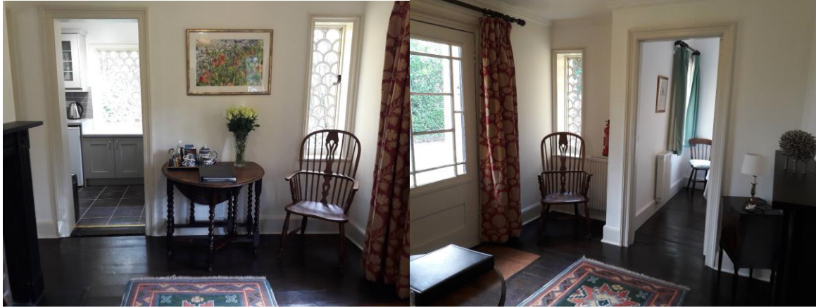
Dining table and view to kitchen