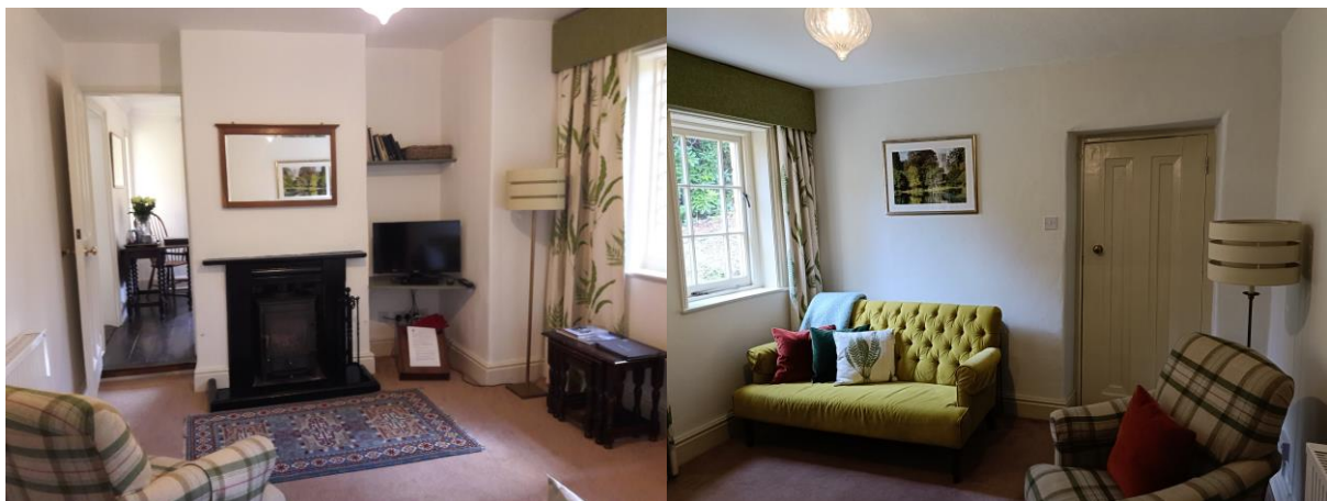
With View to dining hall – with small step