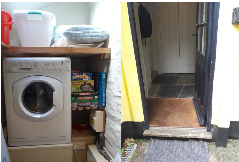
Back door entrance