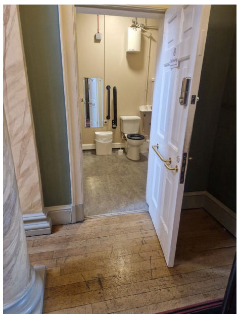
(View through door to accessible toilet from Little Octagon)

There is an accessible toilet available on the ground floor. The accessible toilet is accessed from the Little Octagon (as shown on the floor plan above) from the carpet runner across a short section of wooden floor. This area is lit with a mixture of natural light and artificial light.