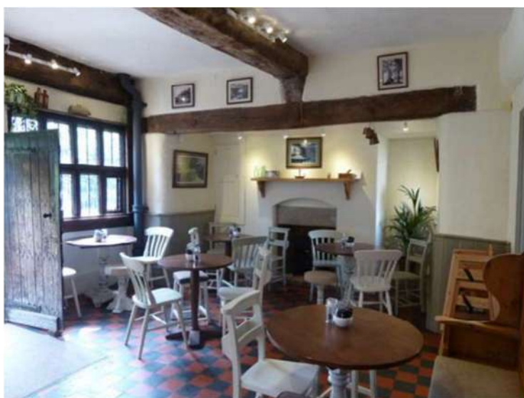
Little Tea Room