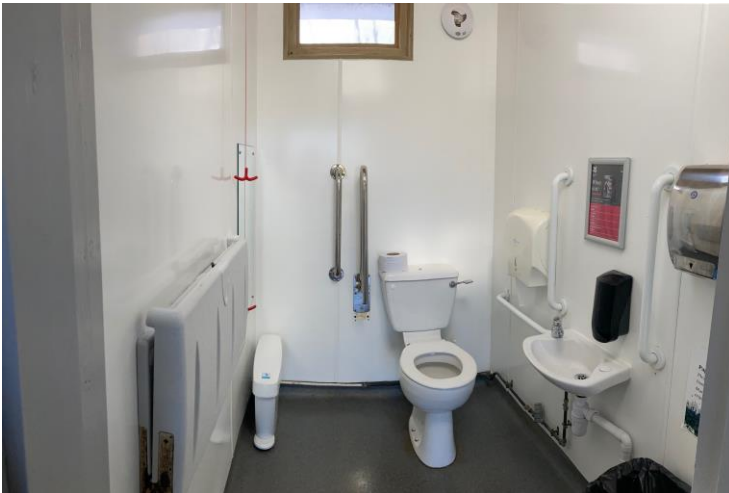
Lizard Point car park accessible toilet exterior & interior