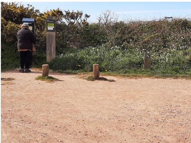
Designated disabled parking space near the P & D machine