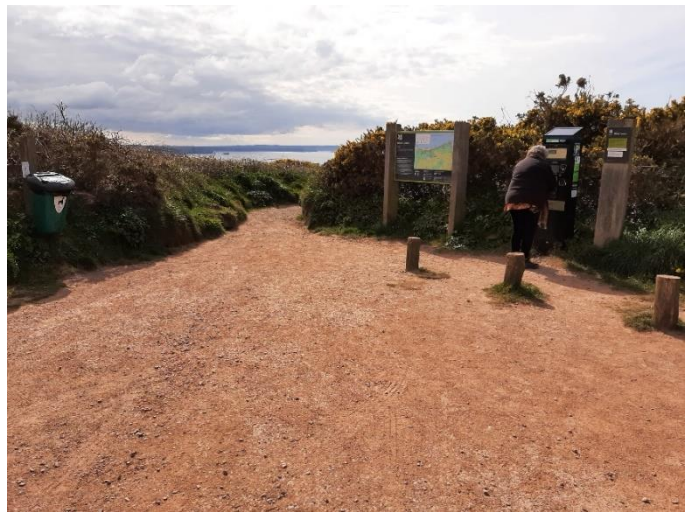
Pay & Display machine, information board and dog bin