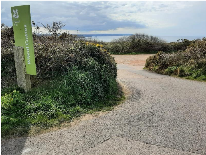
Car park entrance just off Beacon Drive