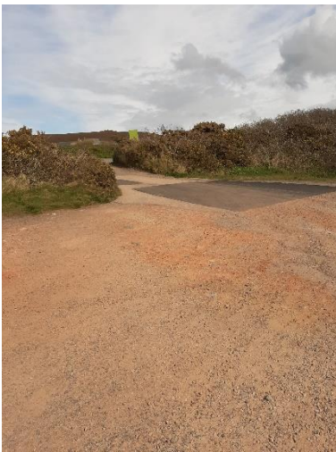
Looking back to the entrance of the car park