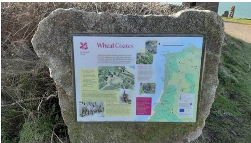
Information board near the mine buildings