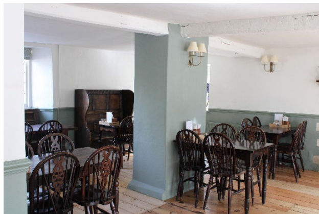
Interior and exterior of the Tea-room.