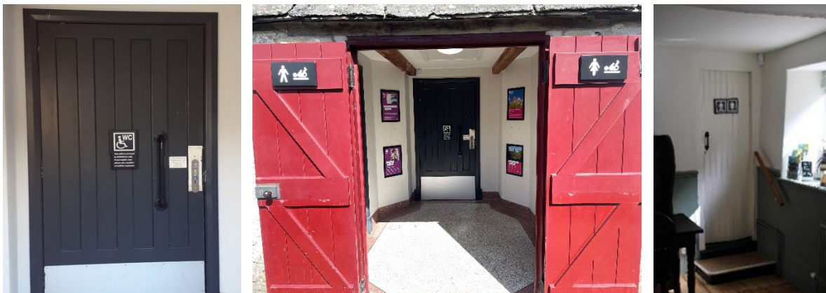
Toilet facilities available in the Welcome Centre, Ticket Office and Tea-room.