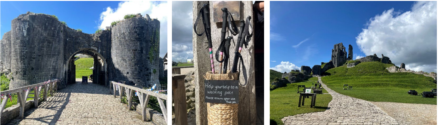
The Outer Gatehouse. Walking poles are available to borrow. The Outer Bailey of Corfe Castle.