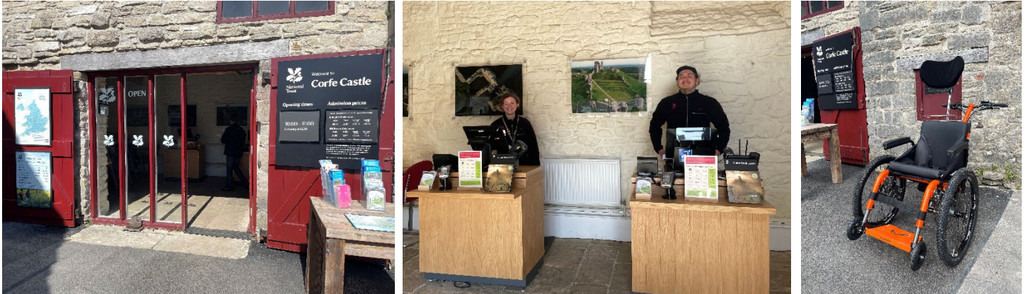
Exterior and interior of Ticket Office. There is an all-terrain wheelchair available to hire here.