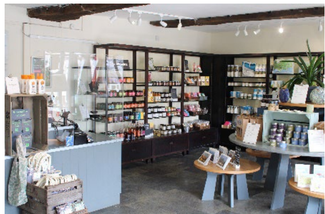
Exterior and interior of shop.