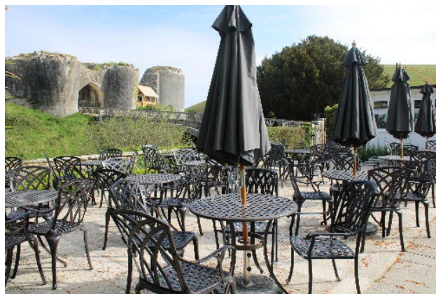
The Tea-room garden.