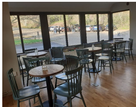
Exterior and interior of Castle View Welcome Centre.