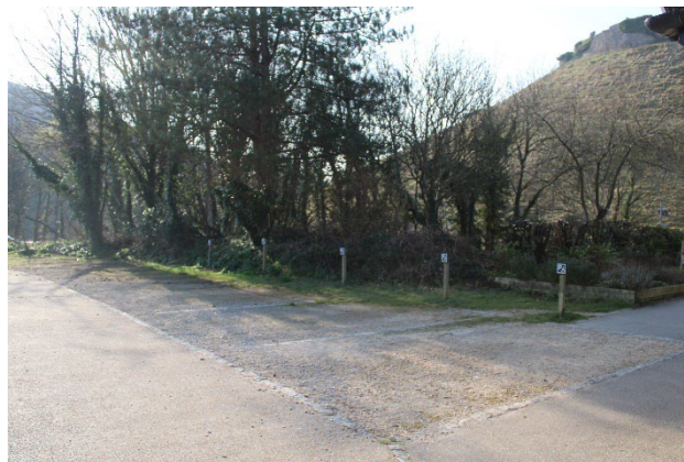
Castle View Car Park entrance. Disabled parking bays at front of building.