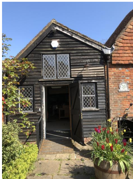
Image: Entrance courtyard with ramp and left-sided handrail into Visitor Welcome