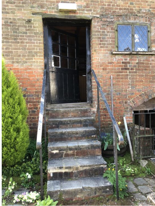
Image: Steps leading from the Mill Room down to the Garden.