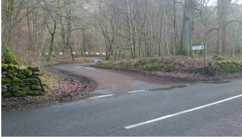
Great Wood entrance for south-