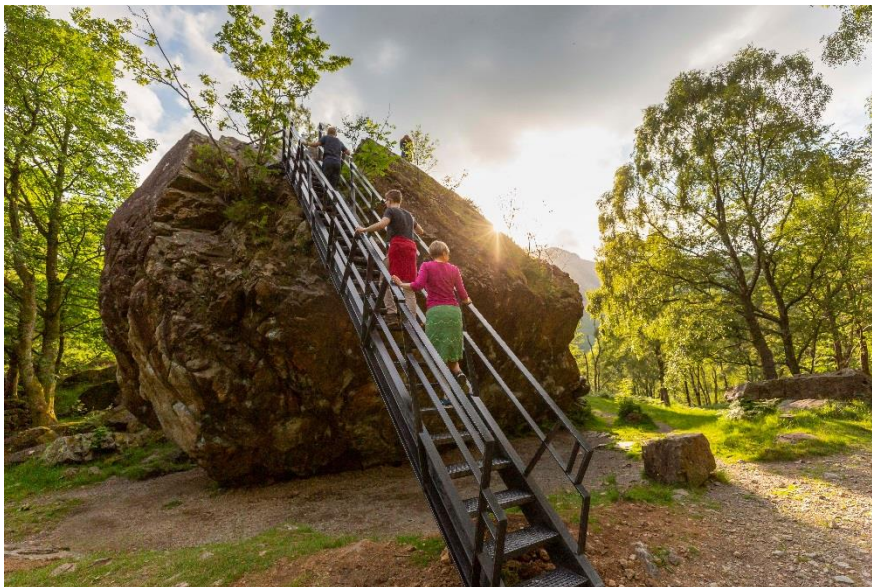
The Bowder Stone with its new ladder

The car park gives access to the Bowder Stone, a house-sized boulder that has come to rest on its edge, seemingly improbably. This large car park has picnic benches and is the obvious option for a visit to the Bowder Stone itself as well as being a popular spot for climbers and hikers seeking a direct way up to Kings How and the crags. A new metal ladder replaced the old wooden one in the summer of 2019.