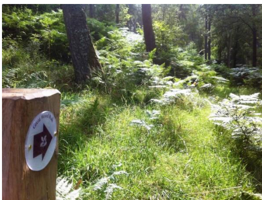
Start of waymarked trail