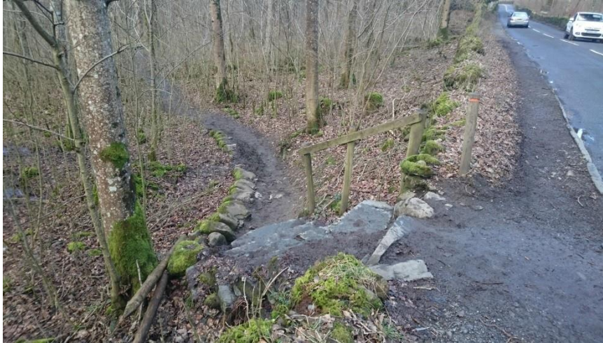
Steps and path to Derwent Water

You can also join a waymarked trail which takes you along the lakeshore to Calf Close Bay where you can see the Hundred Year Stone. (Not wheelchair accessible)