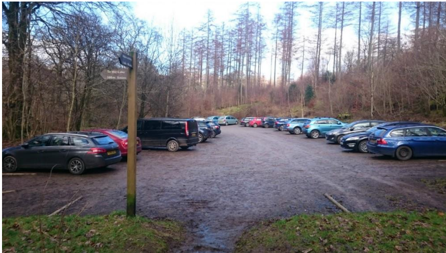
Main parking area

W: www.nationaltrust.org.uk/borrowdale-and-derwent-water