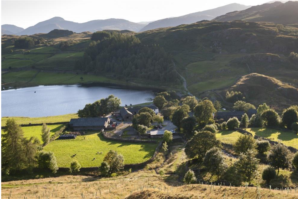
Watendlathhamlet & tarn

W: www.nationaltrust.org.uk/borrowdale-and-derwent-water