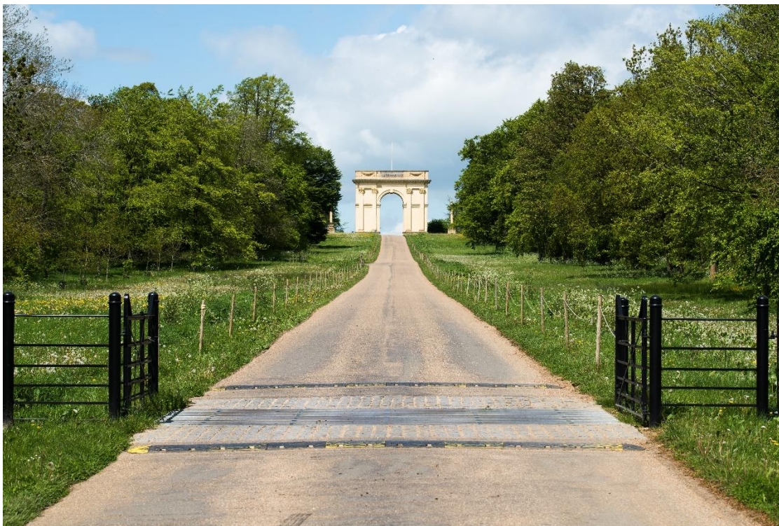
Corinthian Arch at the top of Stowe Avenue, turn right at the arch to enter.

The site is easy to find being situated right outside Buckingham. There are brown signs directing from the surrounding main roads. Once you reach Stowe Avenue you will be greeted by the Corinthian Arch which signifies you have reached the entrance of the site.