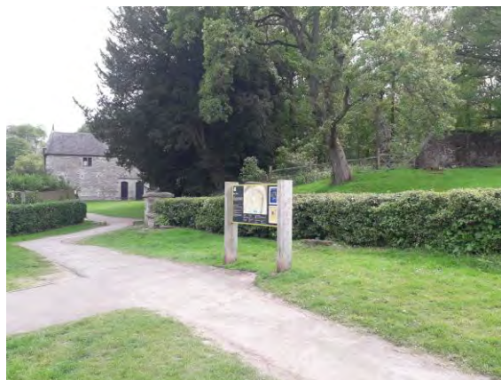
Footpath from car park to stable yard