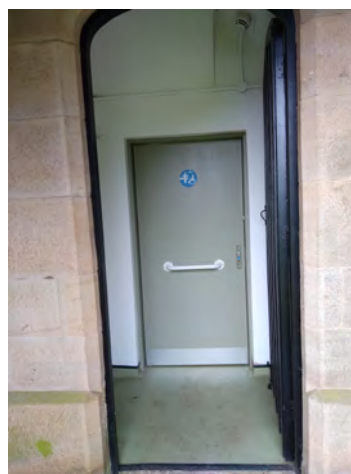
Changing place doorway