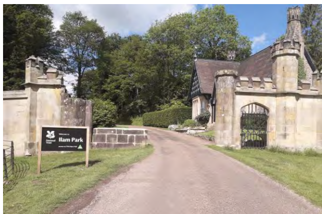
Vehicle entrance to Ilam Park

The second-hand bookshop, toilets and grab and go food outlet are all located in the stable yard, which is approximately 100 metres from the car park, on a tarmac path with a slight downward slope. The centre of the stable yard is cobbles. There is a flat stone path around the edge, which is suitable for a for wheelchair, if you use one.