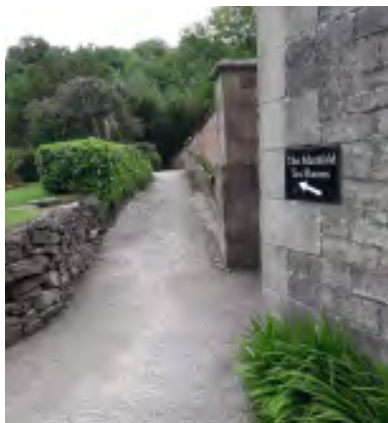
Uphill sloping path to tearoom

During the summer school holidays and summer weekends, the Grab and Go Food and Beverage offer is available in the stableyard. There is level access into the building (there is a small lip in the doorway, marked with hazard tape. The doorway is 76cm wide, or 158cm if both doors are open.