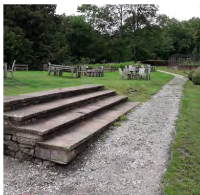
Entrance to tearoom lawn