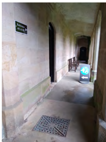
Entrance to the changing place

Accessed with a radar key and located on the ground floor of Ilam Hall, next to the archway. It is signposted with the blue changing place symbol. It is open everyday, 24 hours a day. Spare radar keys are located in the second-hand bookshop and tearoom if needed. The changing place facility has a centrally placed peninsular toilet with room either side for a wheelchair user. There are also grab rails and drop down support rails. There is a privacy screen beside the toilet. There is a height adjustable, adult sized changing bench and a ceiling track hoist which can be used throughout the room.