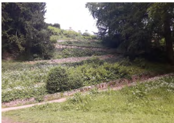
Zigzag pathways in the garden

Paradise Walk is a flat, wide path with a wall alongside one side. On the opposite side are 8 benches, spaced at regular intervals. The path beside the river is partially made of stone, which becomes grass as you approach St Bertram's Bridge.