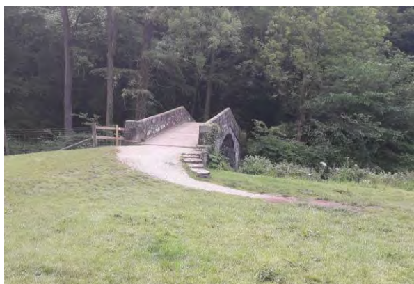
St Bertram's Bridge

The River Manifold flows through the property and access to the river is possible in some places. St Bertram's Bridge, used to access Hinkley Woods, has a hard, smooth surface and a significant slope on both sides. The main path through Hinkley Wood is flat and made of stone. This leads to stone steps which go steeply up the hillside.