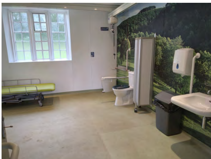
Inside the changing place