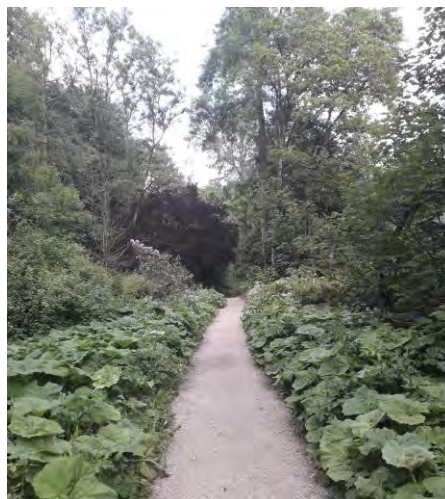
Path in Hinkley Wood