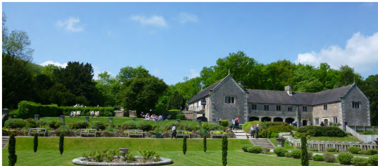
View of the Italian Garden, with the stable yard facilities on the right

Dogs on leads are welcome throughout the parkland and garden. Dogs on leads are also welcome in the second-hand bookshop and grab and go food outlet. Assistance dogs are welcome in the tearoom. There are water bowls for dogs located in the stable yard. There are waste bins which can be used for dog waste in the main car park and stable yard.