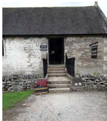
Entrance to the tearoom