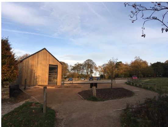
The sloped path between the welcome building and the cafe