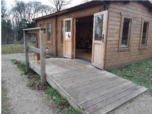
Outside of the Book Den