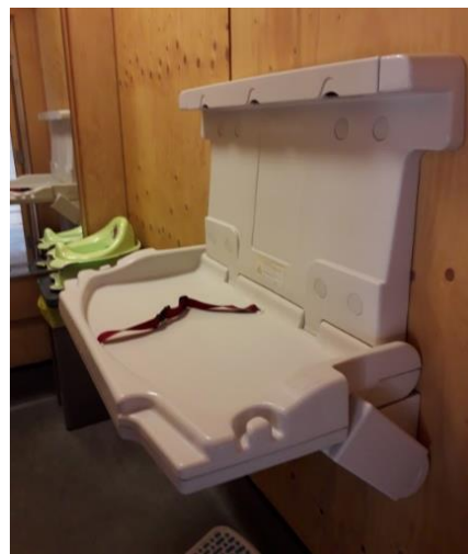
Changing facilities in the MDC