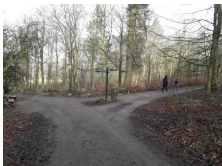
Typical paths on the estate