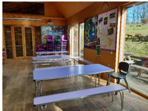
Inside the Moorland Discovery Centre