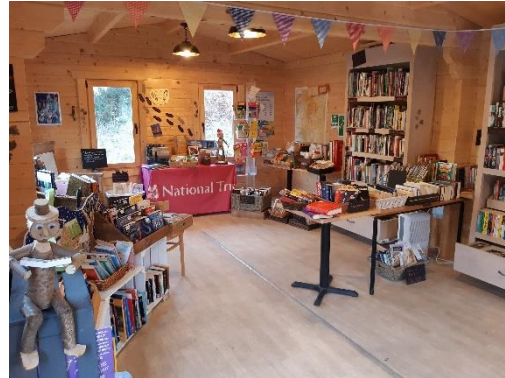
Inside of the Book Den