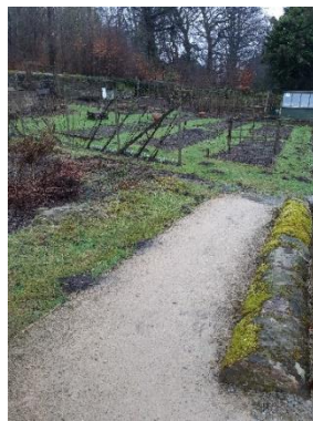
Accessible path to Kitchen Garden