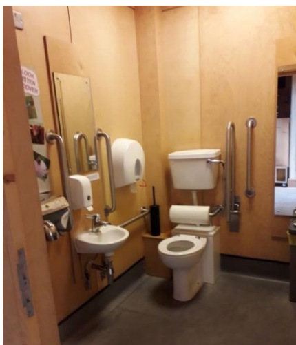
Accessible toilet in the MDC