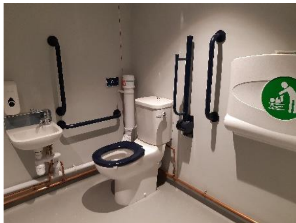
Accessible toilet in the Café