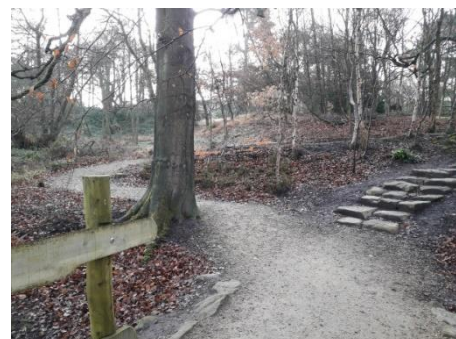
Step and accessible route on the woodland path