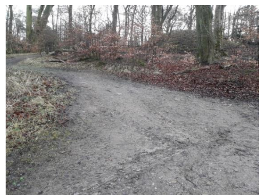
Slope at the end of the woodland path