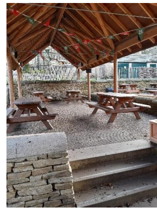
Covered area of courtyard