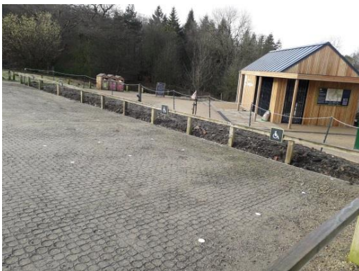
Accessible parking by the Welcome Building