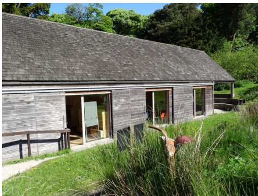
Moorland Discovery Centre