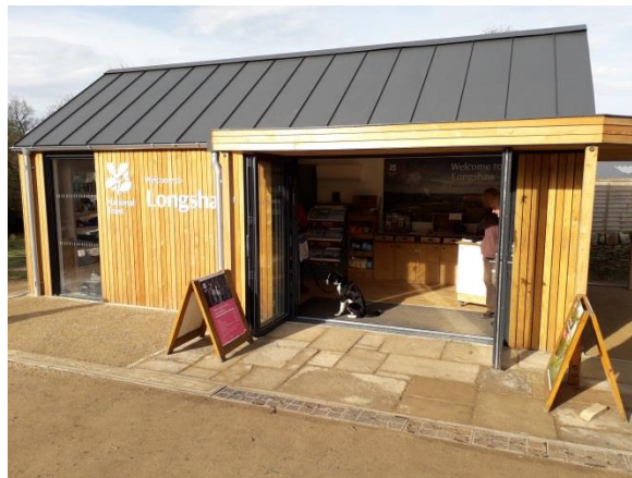
Welcome Building in Woodcroft car park