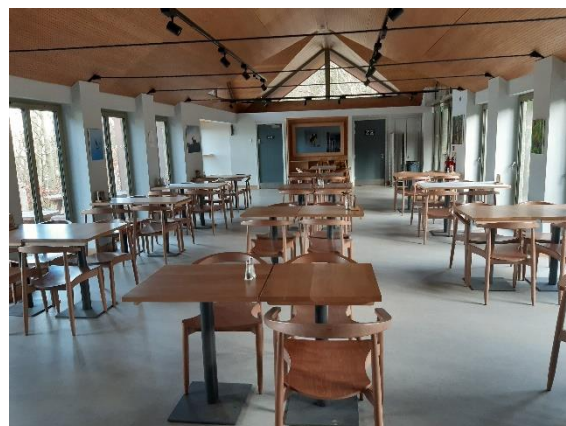
Seating inside the Café