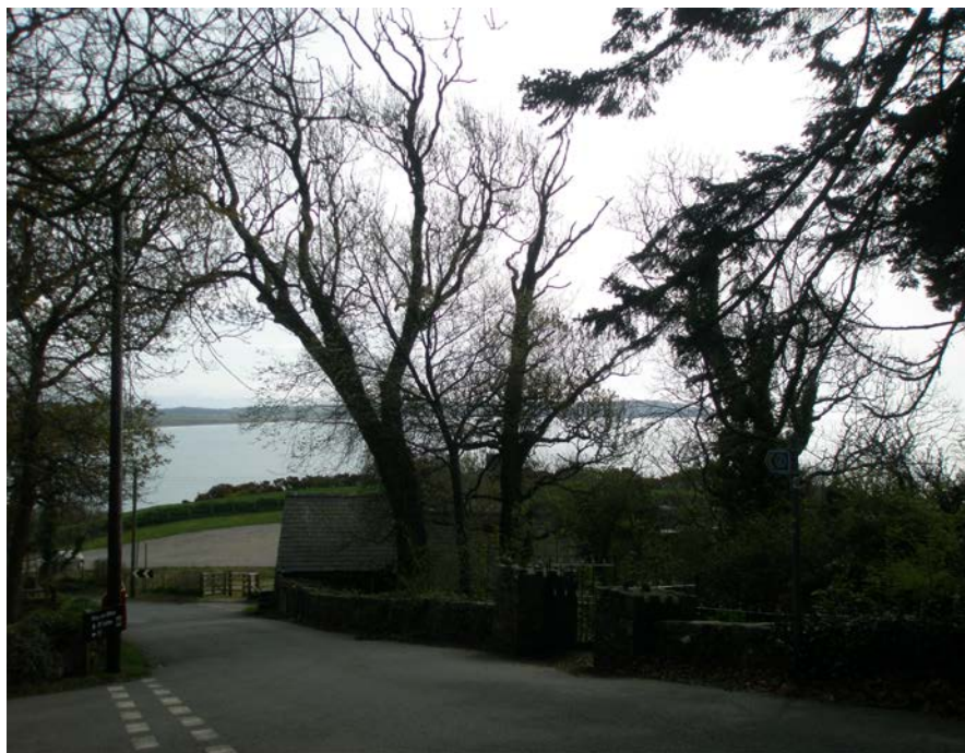
Junction of lane to upper carpark