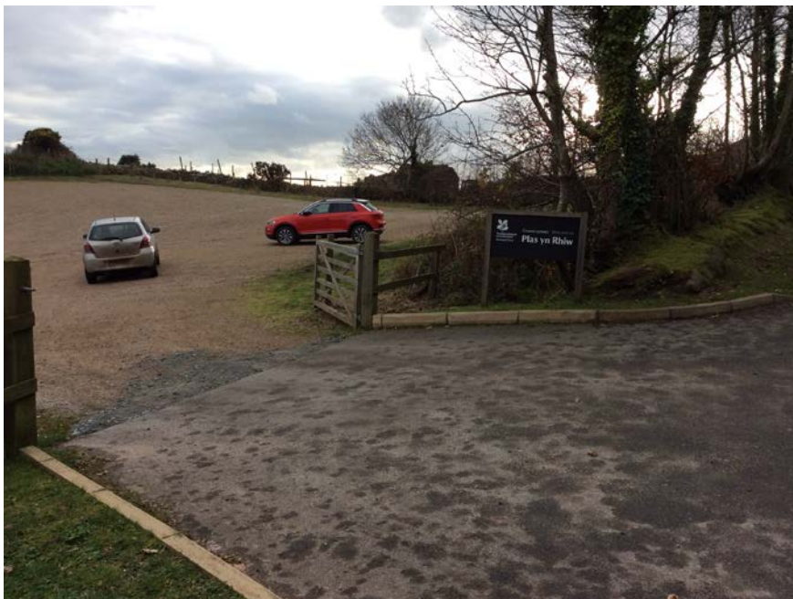
Main car park entrance