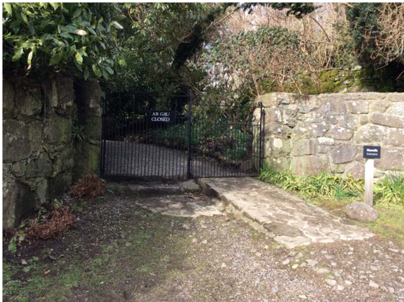
House and garden entrance

The first 4m approach to the gate consists of compacted gravel with some loose gravel, leading to a 2m long, 110cm wide stone ramp with 2 stone steps to the side. There is no handrail to the ramp.