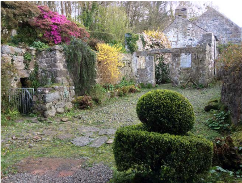
Cobbled yard leading to stable at side of house.