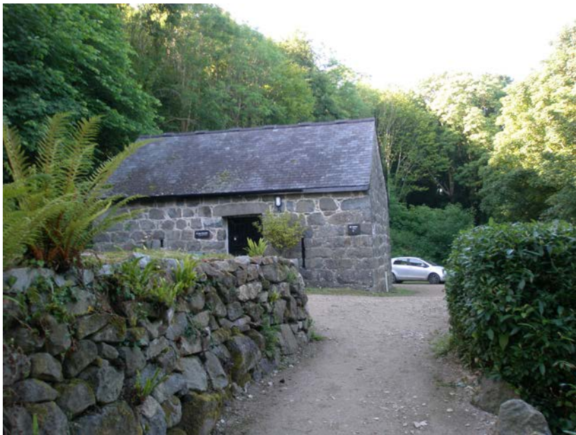
Path entrance to upper car park and visitor reception with toilets at the back.