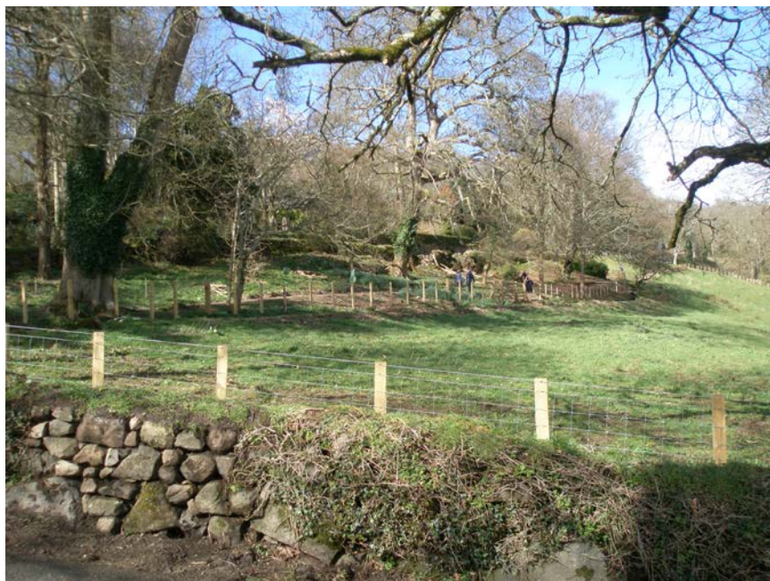
Path from car park along woodland edge