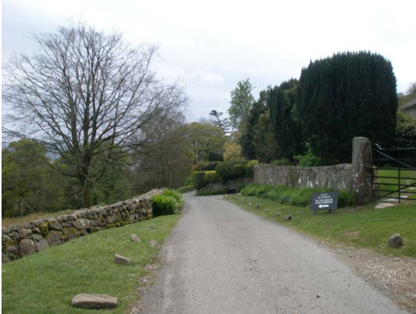
Road from upper car park to house and garden entrance

The first 4m approach to the gate consists of compacted gravel with some loose gravel, leading to a 2m long, 110cm wide stone ramp with 2 stone steps to the side. There is no handrail to the ramp.