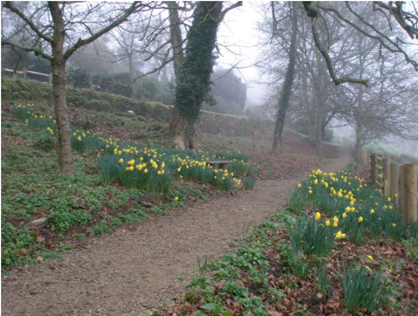
Surface of path from main car park to visitor reception