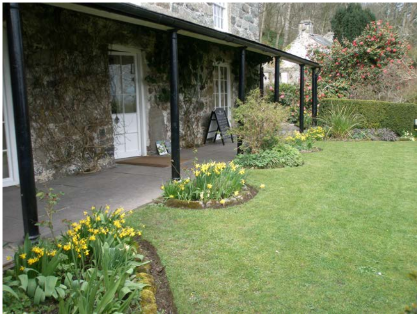
House entrance door under veranda at front of house