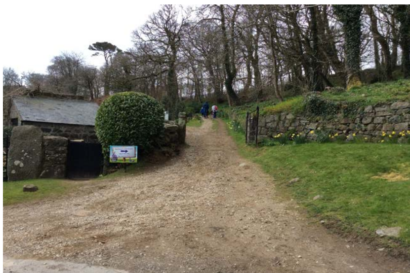
Start of path to picnic area and track to orchard and upper woodland