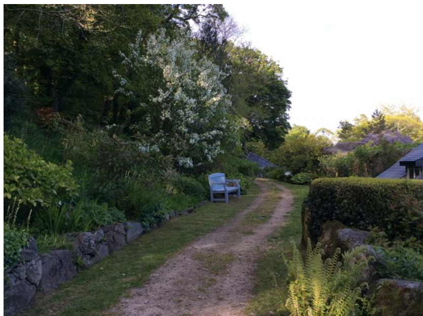
Path to picnic area