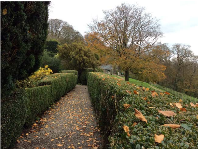
Example of gravelled garden path