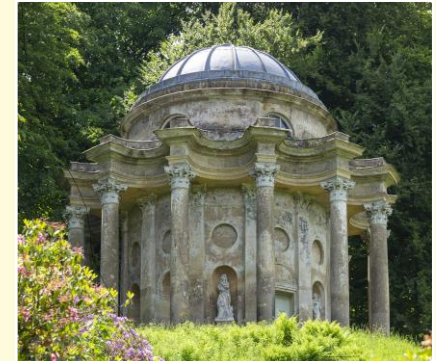
Temple of Apollo