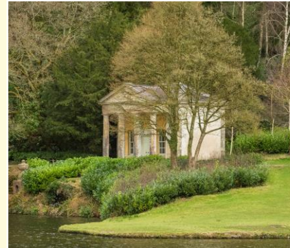
Temple of Flora