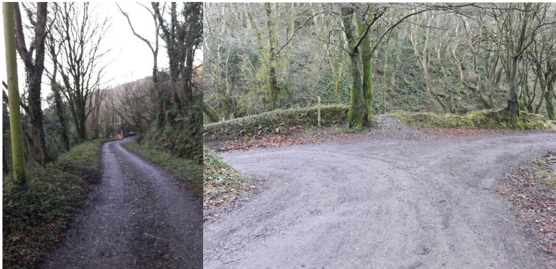
Track to cottage