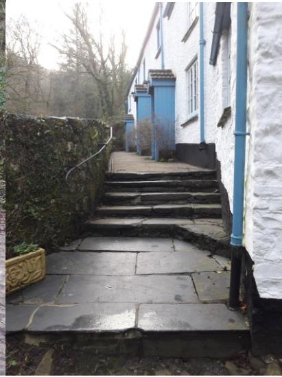
Steps from car park