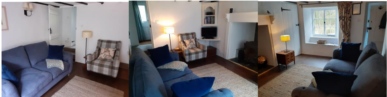
Views to kitchen door and door to bathroom and bedroom