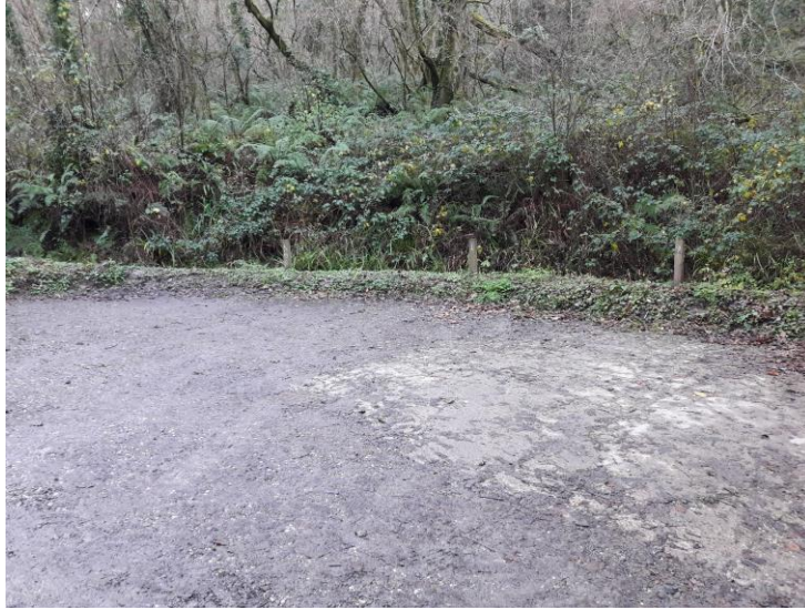
Car parking area (space is marked)