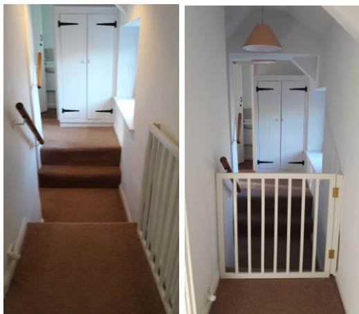
Landing towards WC