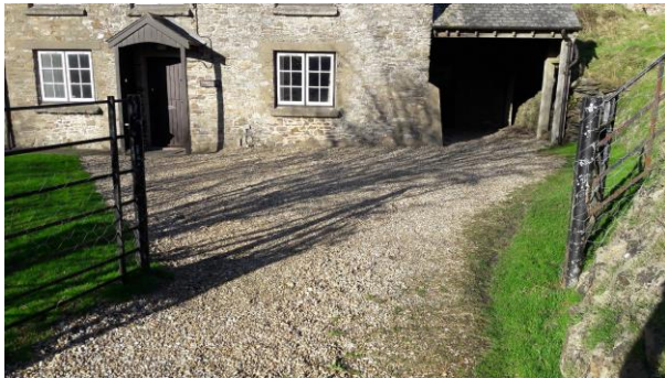
Entrance gate and parking area