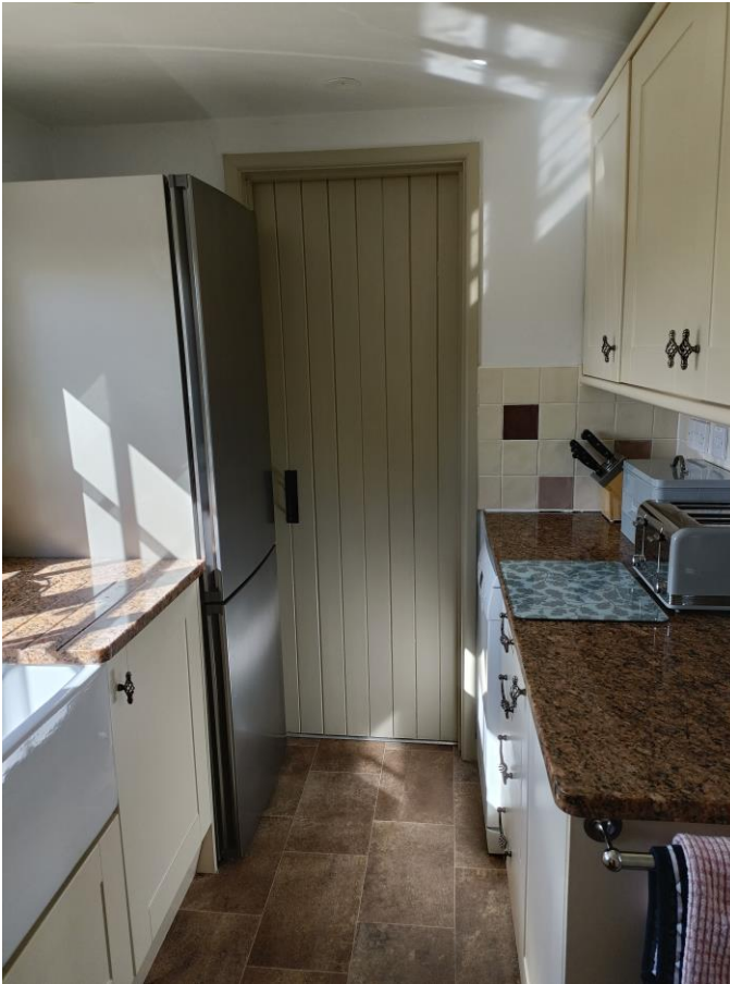
Looking to utility room