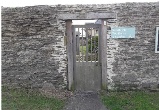
Entrance gate from car park