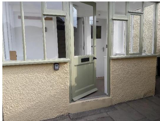
Porch entrance to cottage