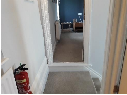
View to double bedroom