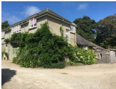
Stable flat with keysafe on logstore shown