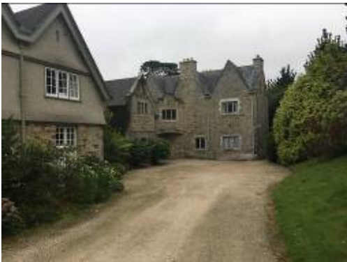
Shared parking area for Chatham and Bosveal