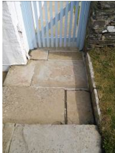
Step down to cottage gate