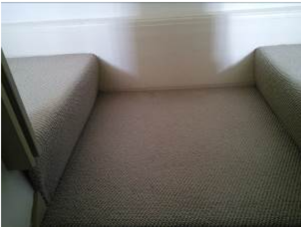
Step to bedrooms and bathroom