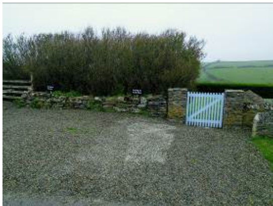
Car parking area