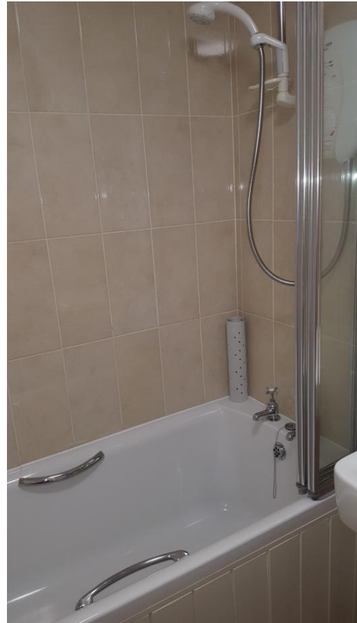
Bath with electric shower over