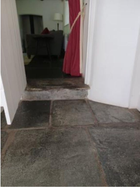
Step from Dining Hall to sitting room