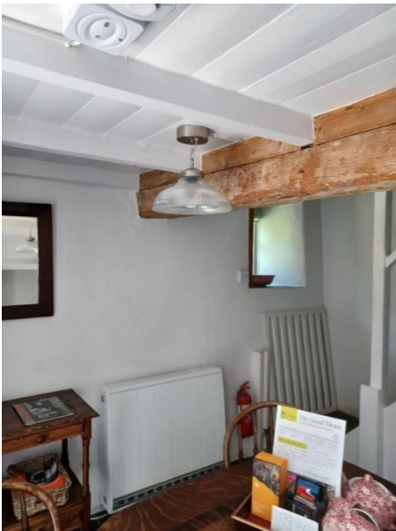
Low beams in Dining hall