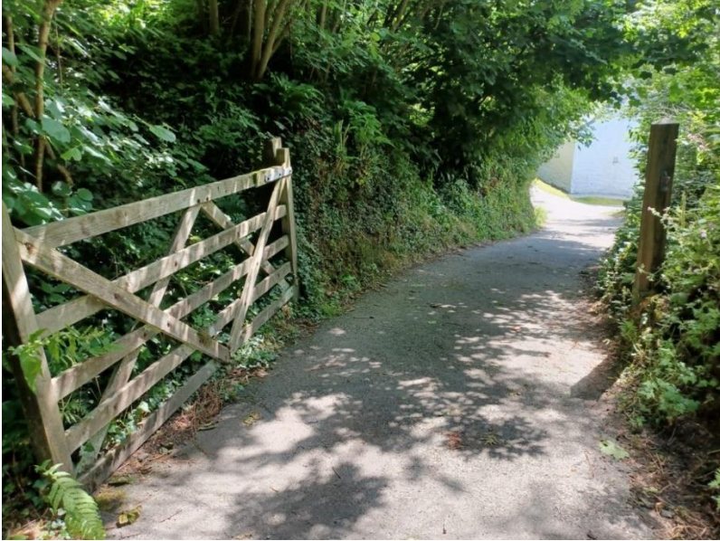
Open gate to last track to Elm Cottage which is on the left of New Mills cottage

Bear left here and after 100 metres along a grassed track, there is a wicket gate with latch into the car parking area.