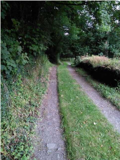
Last track to Elm Cottage.

Bear left here and after 100 metres along a grassed track, there is a wicket gate with latch into the car parking area.