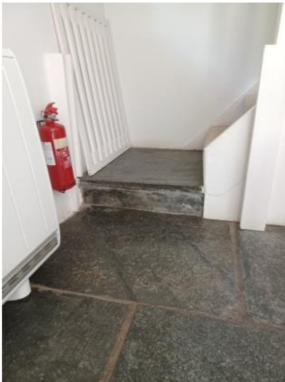
Step from Dining Hall to stairs