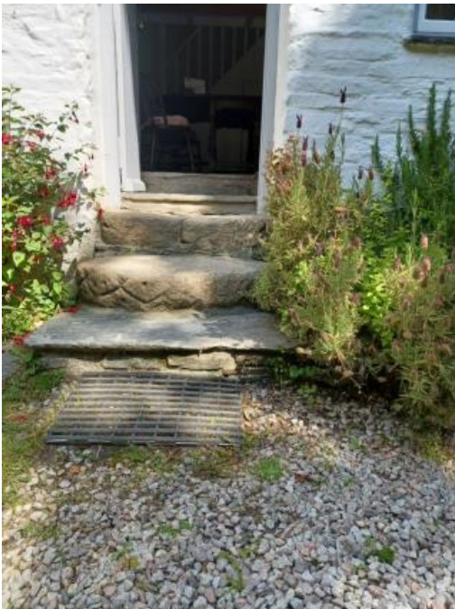
Steps up to front door