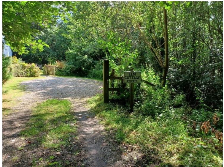
Entrance to Elm Cottage parking area