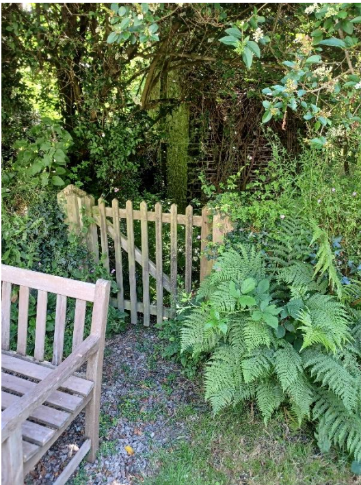
Gate to wooded area