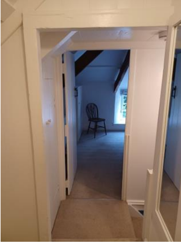
Landing showing low beams and lintels Maximum height of lintel is 1.60metres