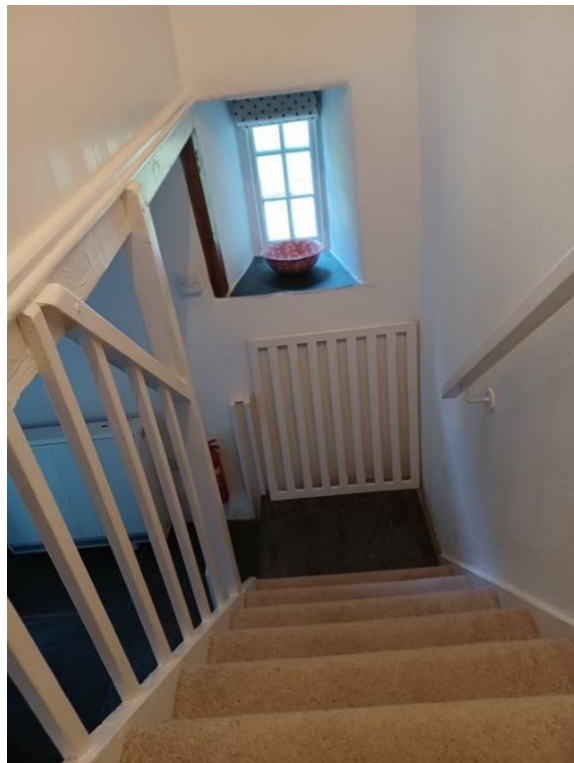
View looking downstairs