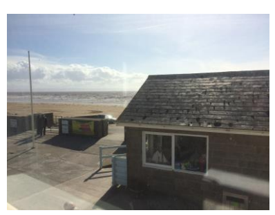
(View from the apartment)

Brean Cove Apartment Brean Cove Café Somerset TA8 2RS