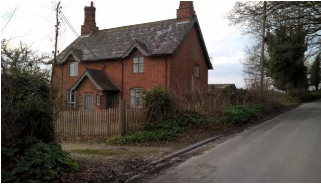
Above: The gravel driveway to the cottage off a lane