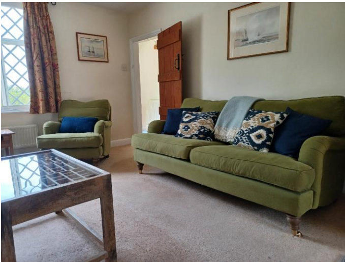
Sitting room from kitchen-diner end