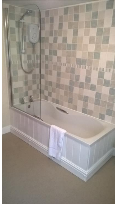
Bath with shower over