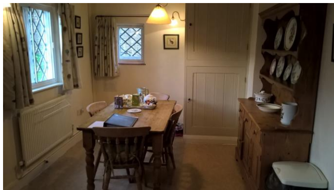
Dining area in the kitchen-diner