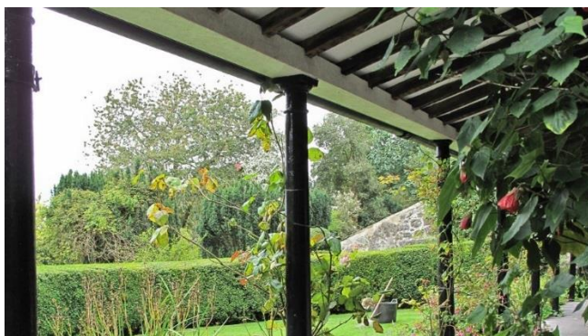
covered path to door of cottage