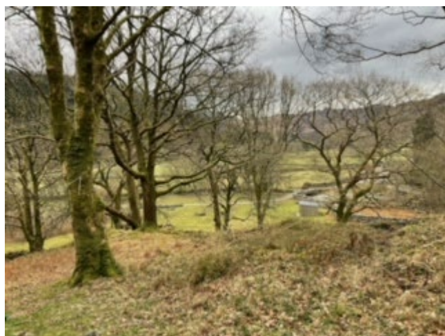
View from Cartref