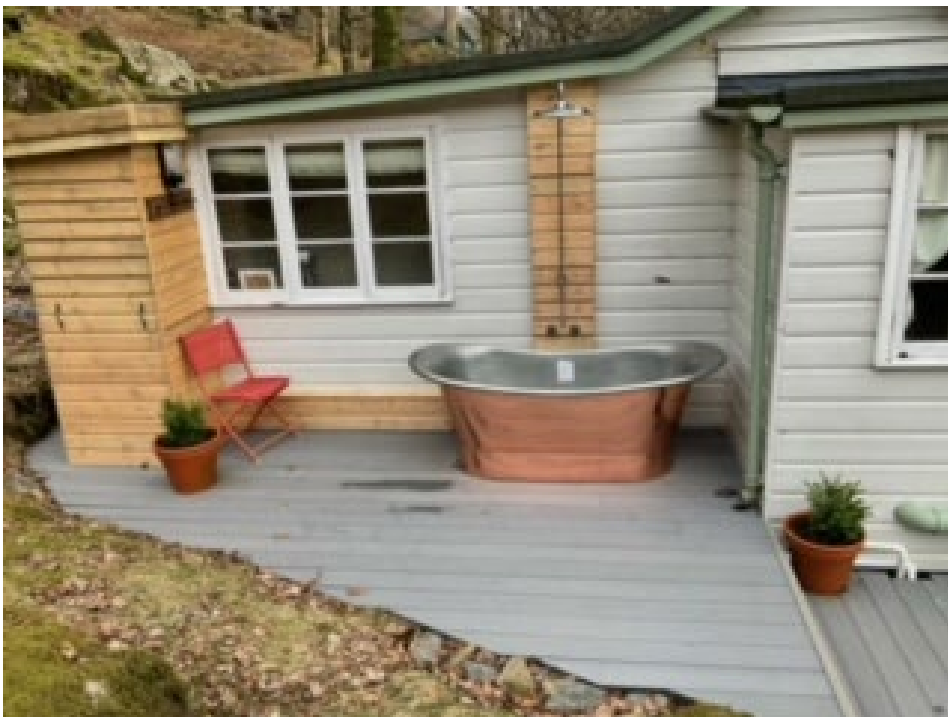
Bath and Shower area