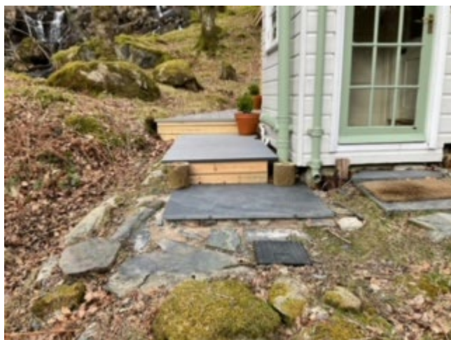
Access to the decking and bath