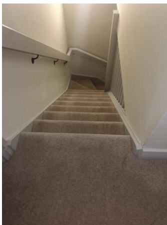
Stairs to 1 st Floor