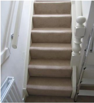
Staircase to second floor