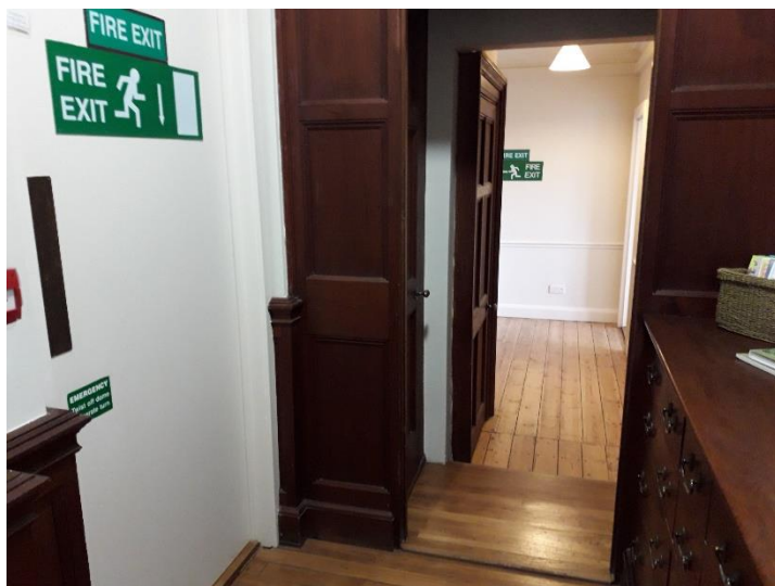
From upper hall towards lower hall