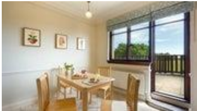
Kitchen with glazed door to veranda