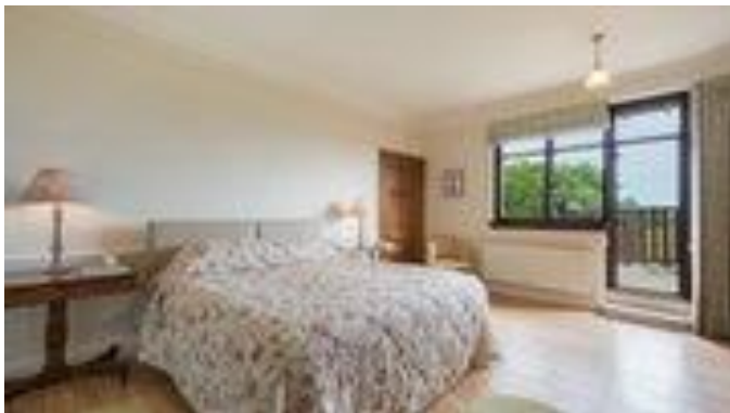
Super-king bedroom with glazed door & step to veranda