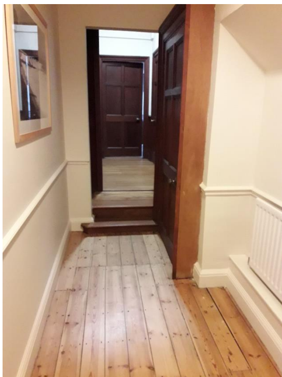
Inner hall towards living/dining room room