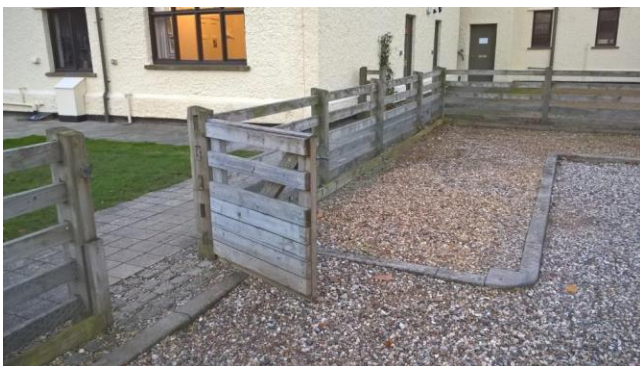
Gate from parking area to path to base of external steps